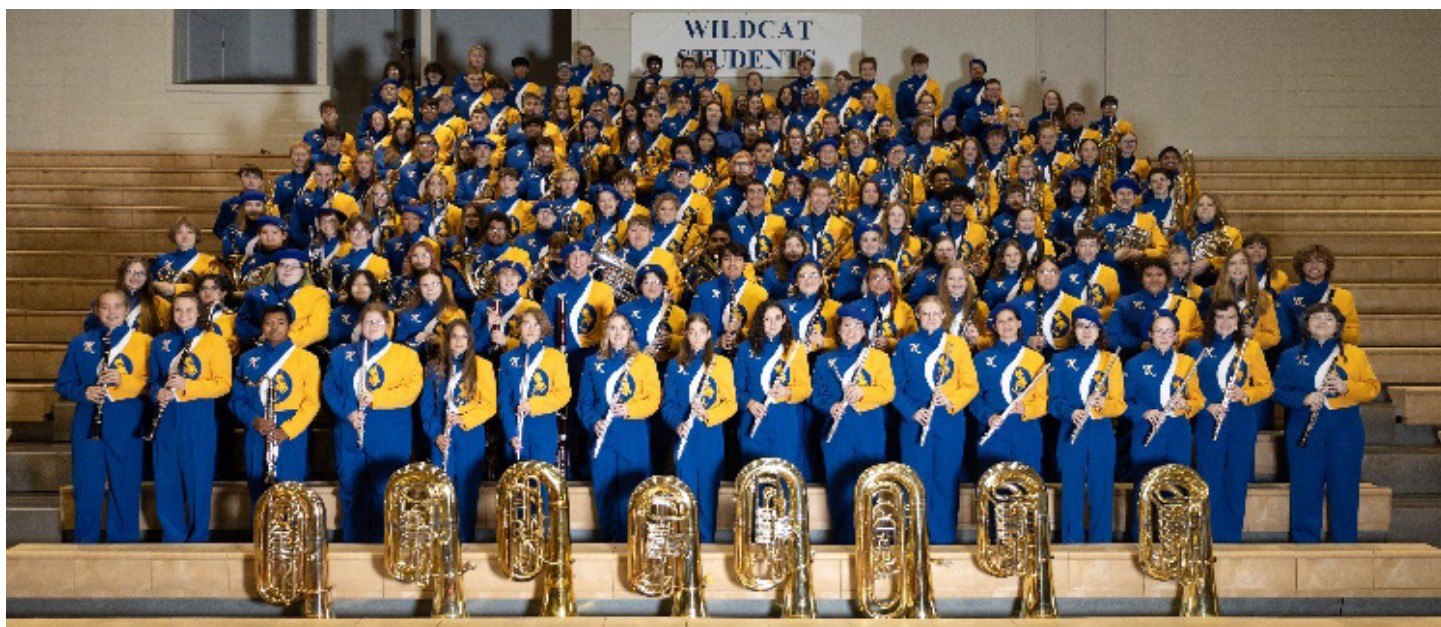
2024 Kansas Lions Band at Baker University, Baldwin City, KS.