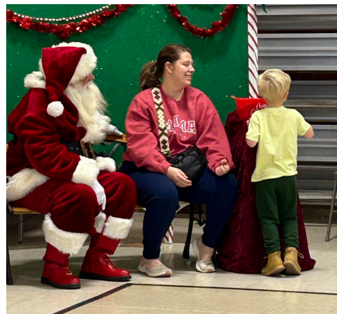
Auburn Lions Community Christmas at the Auburn Community Center Dec.6.