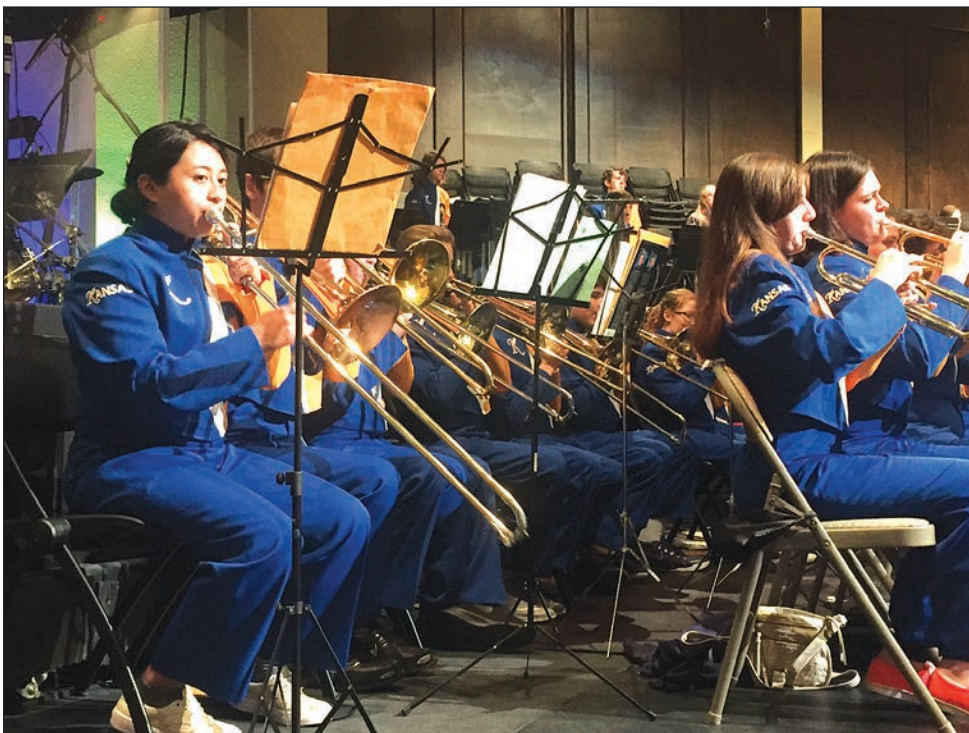
The Kansas Lions Band performs in concert on Saturday, June 3 in Wichita.

More Convention coverage on pages 10-13 & 18