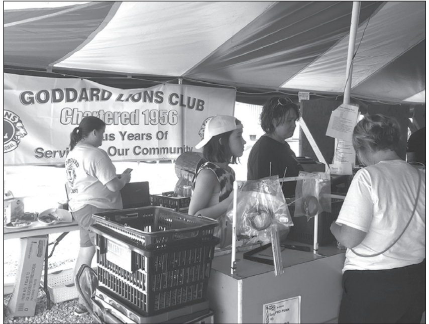
Goddard Lions Club volunteers sell fireworks to raise funds for projects.

While running the fireworks stand, the club also is a co-sponsor and helps staff the community's Fourth of July Celebration, which includes a professional fireworks