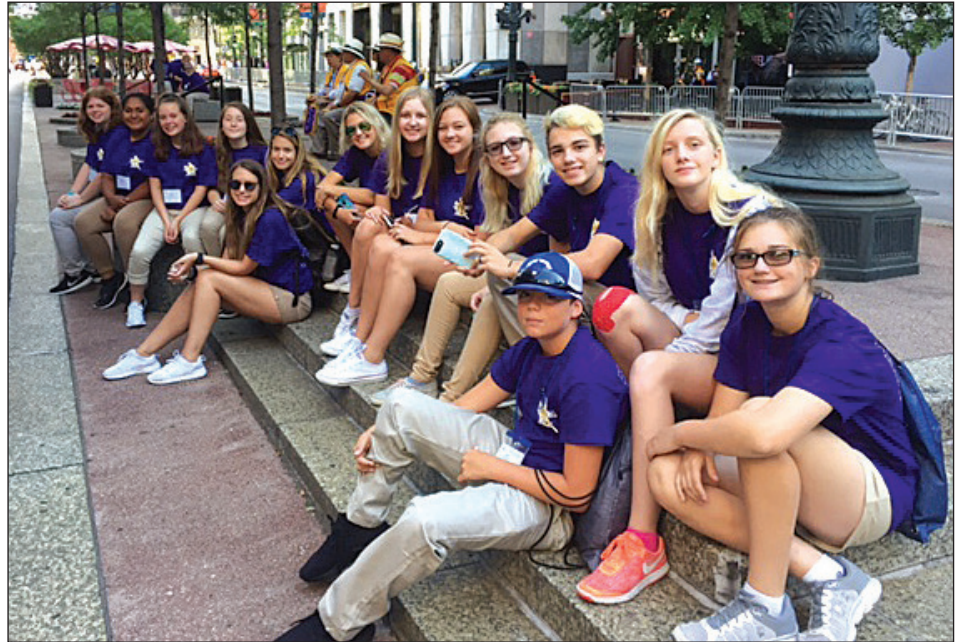
Kansas Leos enjoyed a whirlwind trip to LCI Convention in Chicago.

On Saturday, the Leos marched at the beginning of the parade with the Leos of the World. When that was done, we walked back to the staging area of the parade to march with the Kansas delegation. Finishing about 1:30, it was quicker to walk back to the hotel than to wait in line for the shuttles...so off we went. We had an early dinner (Chicago-style pizza) and then the Leos went to the Connecticut Teen