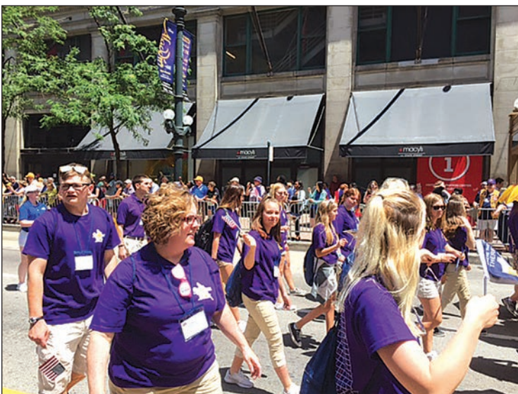
Kansas Leos walk in the International Parade in Chicago.

Lions, the money you contributed for these Leos was invested wisely in their exposure to Lionism on a world scale. They participated in a service project, attended a Lions' plenary session, met Leos from around the world, marched twice in the parade, and represented Kansas beautifully wherever they went. We received several compliments on their behavior and their positive attitude while doing the service project. Thank you for helping to develop leaders and helping them see the magnitude of the reach of Lions.