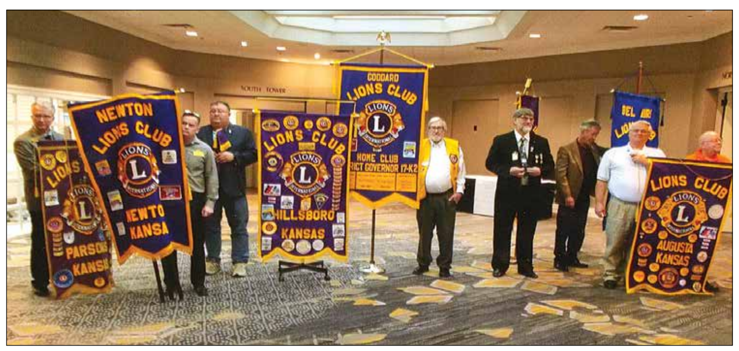
Proud Kansas Lions stand with their club banners at the 2018 District N Convention. All clubs are urged to bring their banners to Wichita June 1-2, where they will be displayed at the convention, including at the Saturday evening banquet.