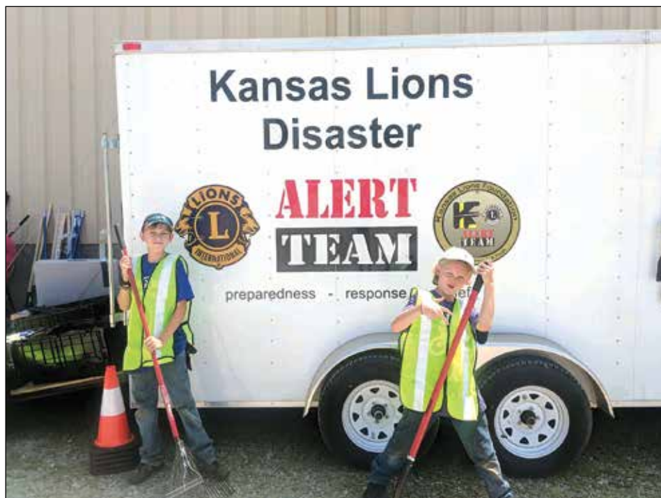
These enthusiastic young volunteers were just two of many who helped Kansas Lions distribute clean up supplies in Eureka after the community suffered significant damage from an EF3 tornado on June 26. More photos on page 4.

The tornado that hit Eureka on June 26 was rated an EF-3. The tornado stretched one-quarter mile in width and had a wind speed of 152 mph. The National Weather Service issued a tor-