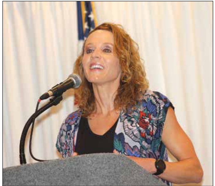
Claflin native Jackie Stiles shares her story with Lions.

She began piling up awards and records in high school, becoming the leading scorer in Kansas high school history. She set a state record for a single game, 71 points. And her drive also made her a force in cross country, on the track and