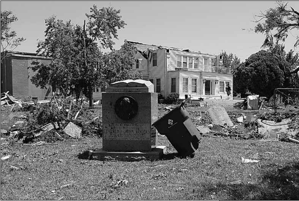
At left and below, the June 26 tornado wrought significant damage to the Eureka community.