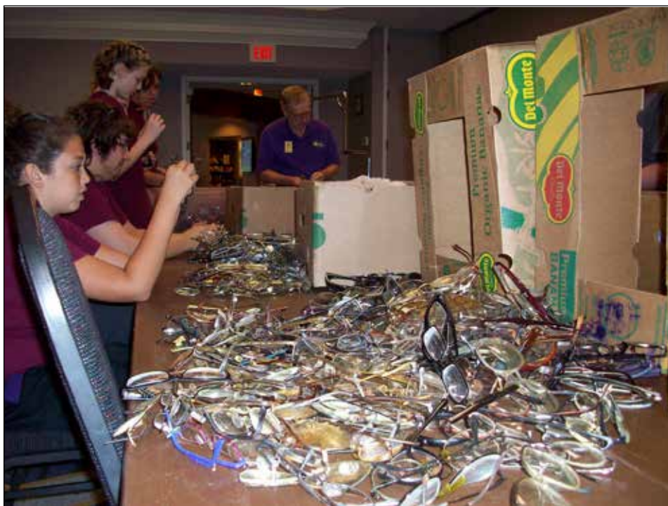
Above, Leos from Goddard and Mulvane contributed a valuable service when they learned the process and helped sort eyeglasses at State Convention. That process included distinguishing useful items from trash and how to pack banana boxes (below).