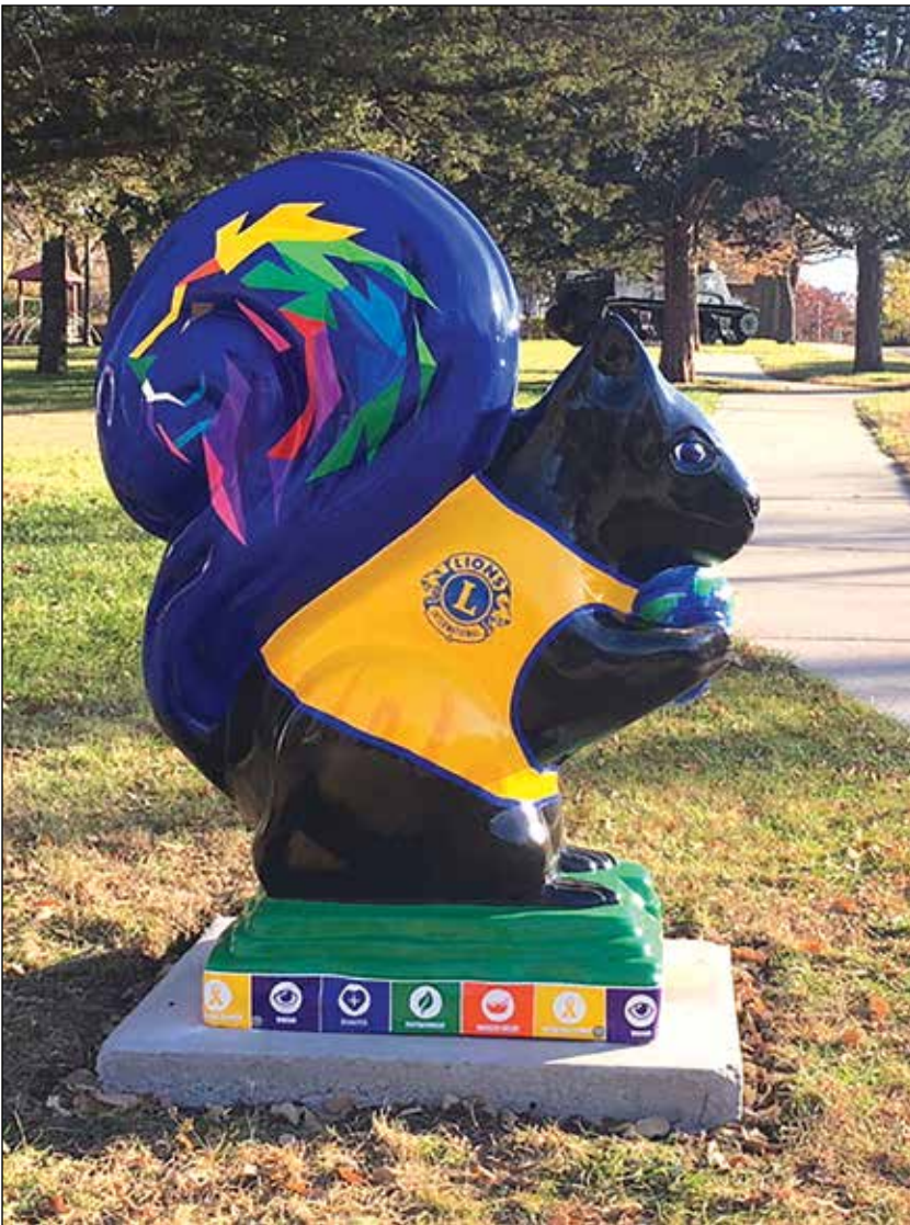
Leo the black squirrel greets visitors to Lions Park in Marysville. He is the Marysville Lions Club's centennial project.