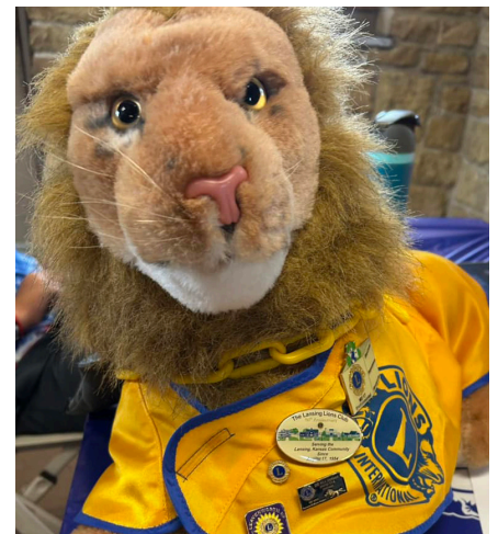
Leonard the Lion will be traveling 17A