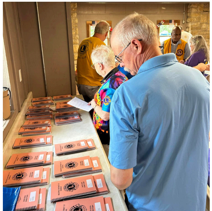
Directories available at the District Cabinet Meeting - Zone Chairs will deliver them to their clubs.