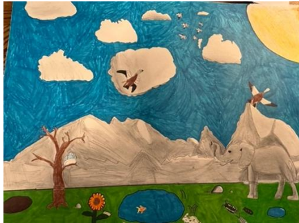
1 st . Place

All three posters were great, making judging difficult. These three students should be recognized for stepping up to participate. They will be future leaders who will change the world.