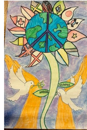
3 rd . Place