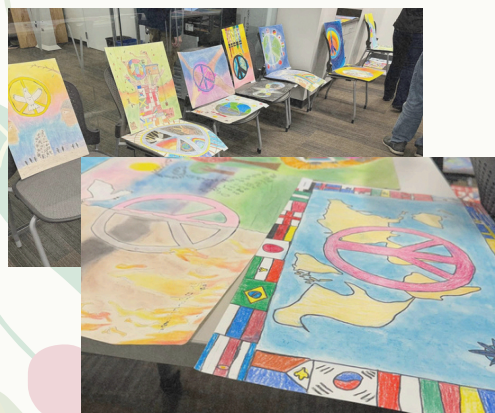
Lawrence Noon Lions Peace Posters