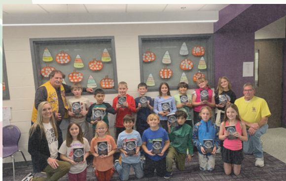
Linwood Lions donate dictionaries to 3rd graders