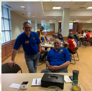
Leawood Lions Pancake Feed