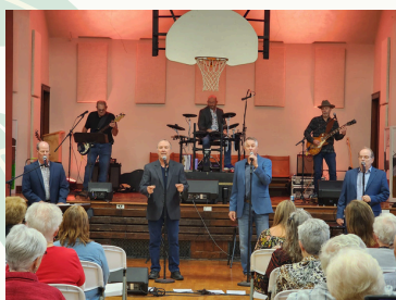
Navarre Lions Club