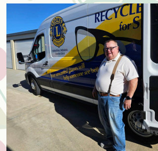
Recycle for Sight