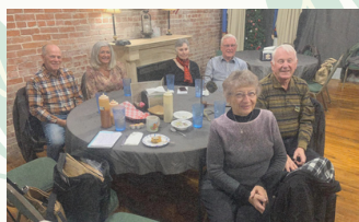
Thanksgiving in Miltonvale