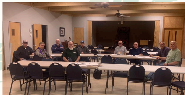
Randolph Lions Club