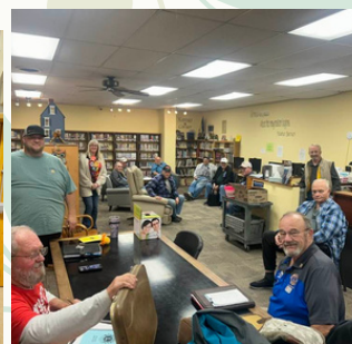
Effingham Lions at the Library