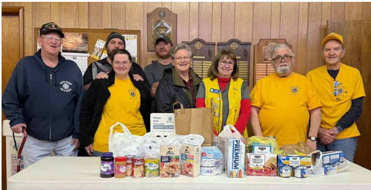
Baxter Springs Lions Club collected food and paper supplies for the local food pantry