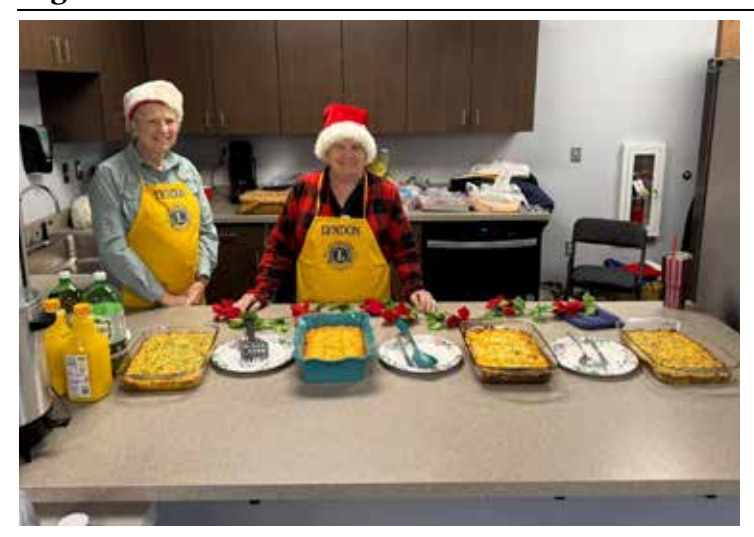
Lyndon Lions served a holiday brunch for seniors in their community.