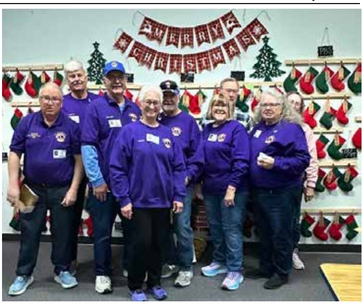
Bel Aire Lions provided holiday treats for teachers and staff at Isely Elementary School.

Westphalia Lions spread holiday cheer in their community with fruit baskets for seniors and shut-ins (photo at right) and candy for the students at Westphalia Grade School (photo below).