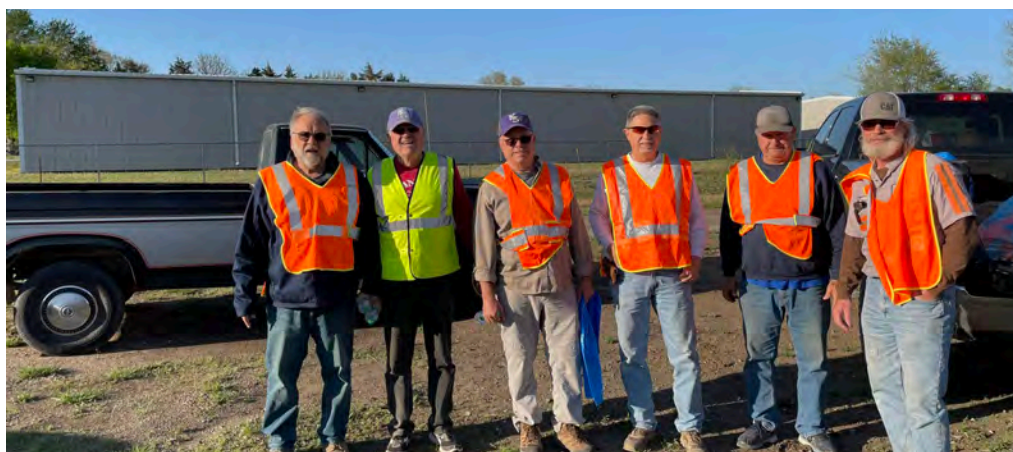
Marquette Lions picked up trash in ditches along the road leading into their community.