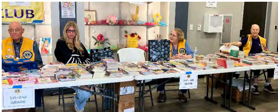
Valley Center Lions hosted a Free Book Carnival and helped run games for the annual Spring Family Party at the Valley Center Public Library.