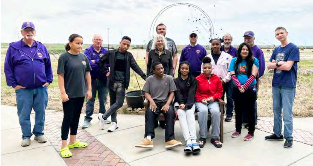
Members of the Bel Aire Lions Club donated a Trex bench to Northeast Magnet High School for the Griffin Gardens project