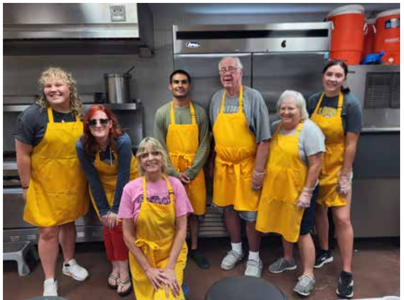
Concordia Lions — and a host of community volunteers — have served up Cloud County Community Supper on the first and second Wednesday of the month for more than 20 years.