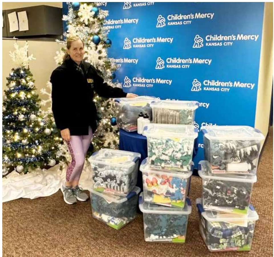
Miami County Traveling Lions have created "Cancer Care Kits" for children undergoing chemotherapy since 2020.