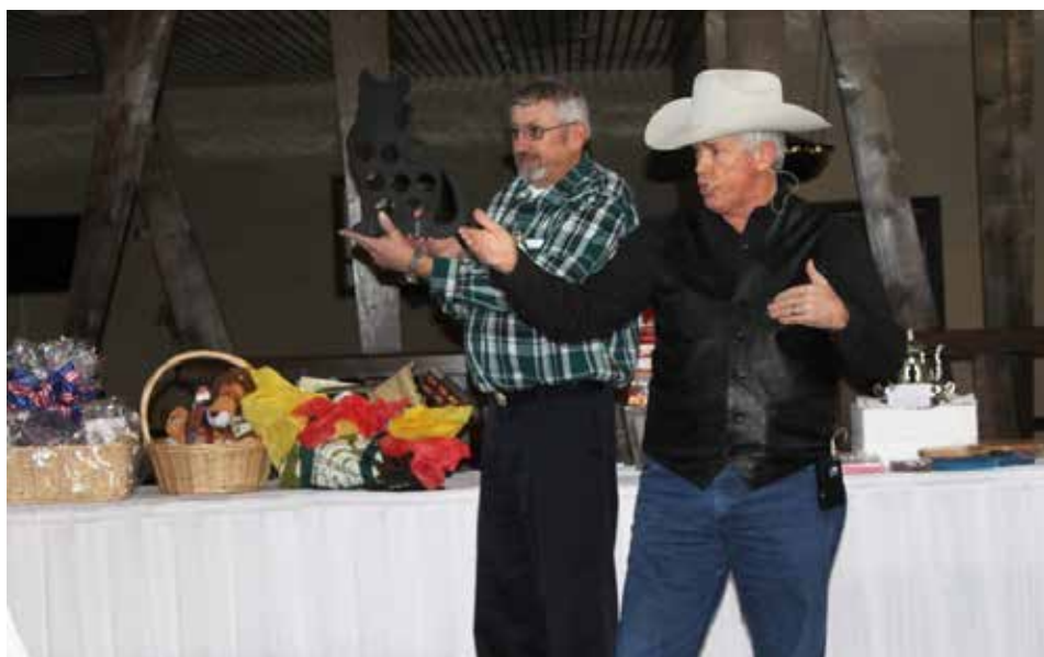
Coaxing a bid at the Band Auction in 2017. Bring your donations — and your checkbook — to the 2025 auction at Mid Winter Rally.