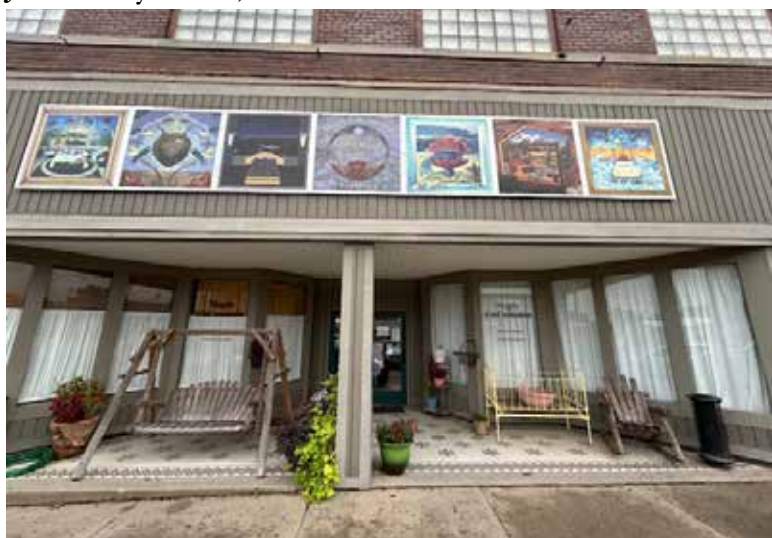
The Maple Uncommon in downtown Columbus is a gallery for local artists and home of the Columbus Lions Club.