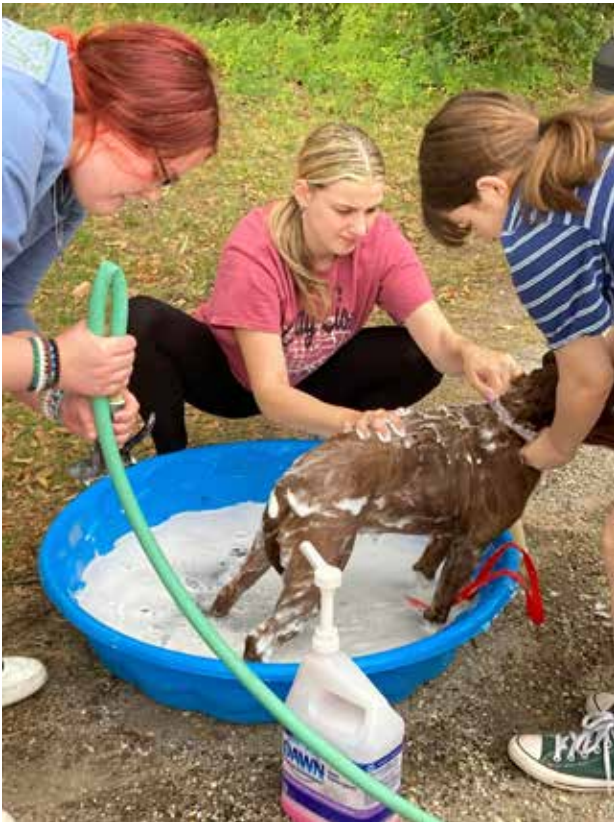
Baxter Springs Leo Club members helped the Baxter Springs Animal Control and Shelter with an Adopt-A-Pet event at a local coffee shop. Before the event, Leos visited the shelter and gave the pups a bath.