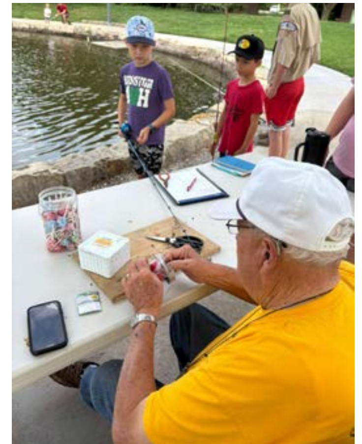
Hesston Lions hosted a fishing clinic at the pond at Schowalter Village, a local retirement community. Kids and adults enjoyed a morning of fishing.