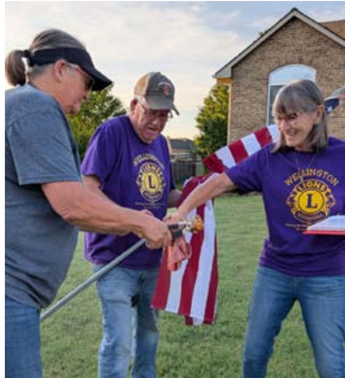
Wellington Lions were out early Memorial Day morning putting up flags around the community. The flag "subscription" where the club puts flags in yards on specific holidays is a successful fundraiser for the club.