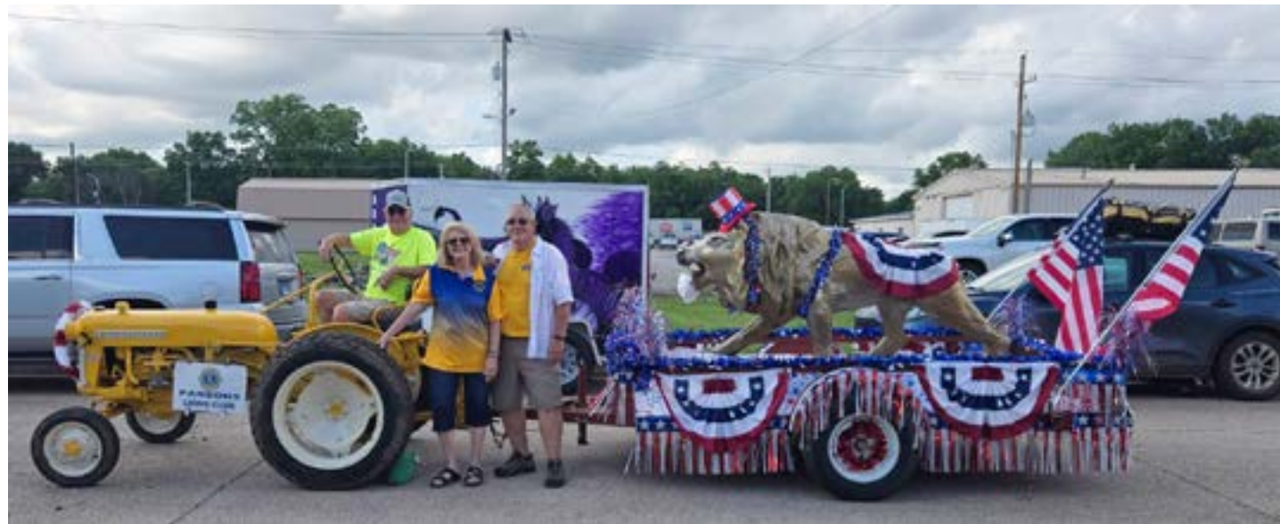
Parsons Lions were represented in the Katy Day parade.