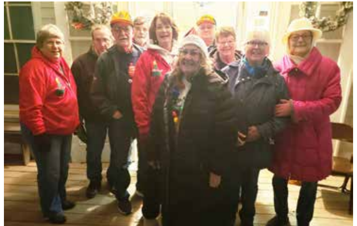
Augusta Lions served up hot cocoa and cookies at the Augusta Historical Museum following the Augusta Christmas parade.