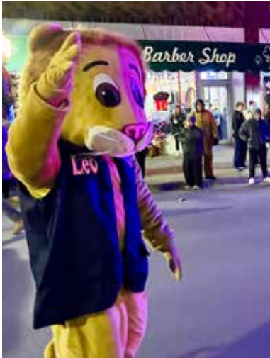
Leo in the Newton Parade of Lights

At left and below: Moundridge Lions raised $7,500 with a soup supper and gun raffle for a child in their community facing a challenging medical crisis. On the club Facebook page: Community by definition is "a feeling of fellowship with others, as a result of sharing common attitudes, interests, and goals." Goes to show that when there is a need the Moundridge community is there for one another!