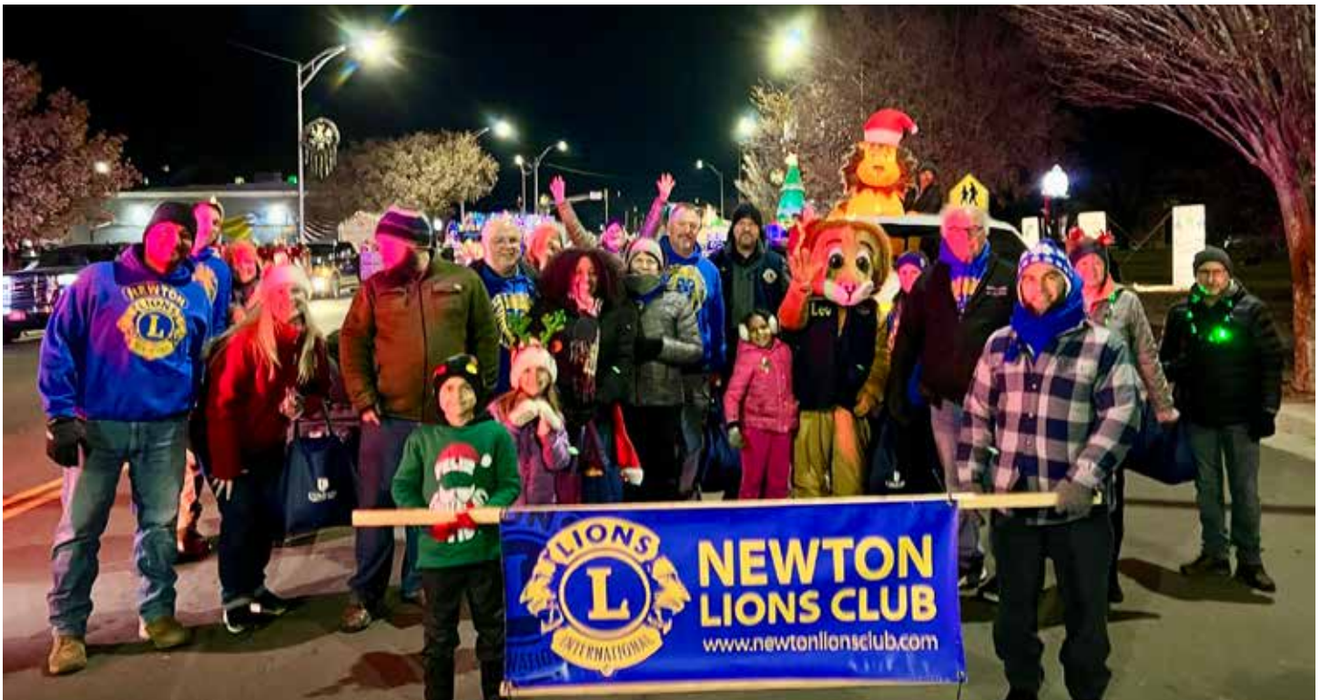
Newton Lions Club sponsors the Parade of Lights to bring Christmas cheer to downtown Newton in early December.