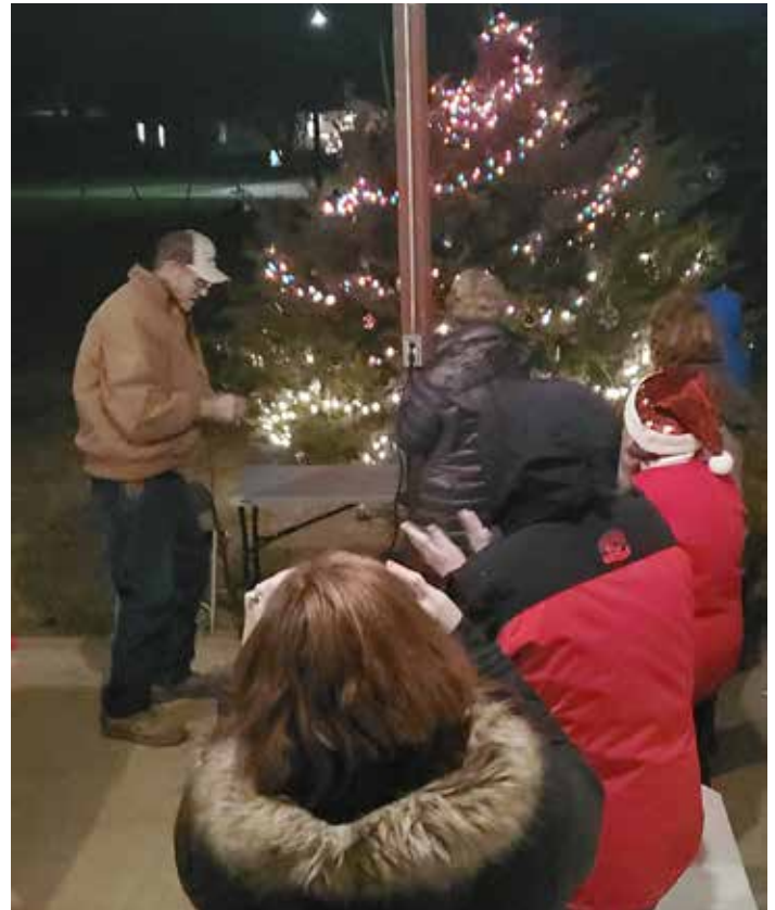
Westphalia Lions lit a Memory Tree in the community park