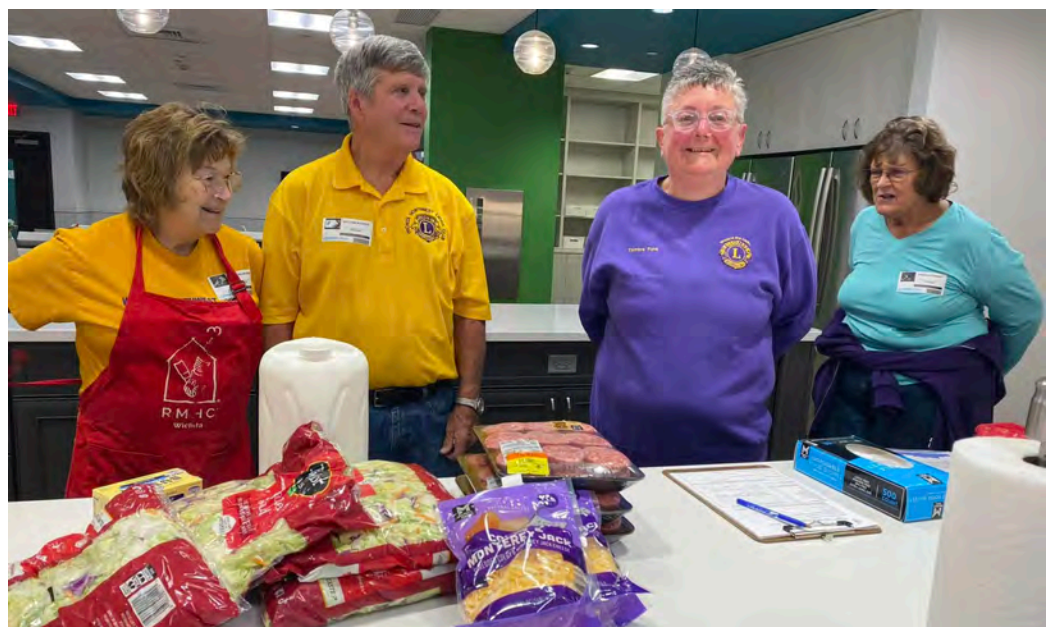
Wichita Northwest Lions prepared a meal at a Wichita Ronald McDonald House.