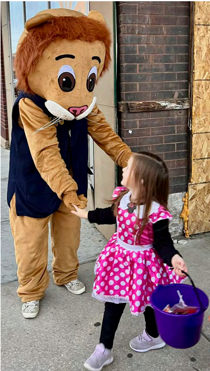
Newton Lions Halloween Walk