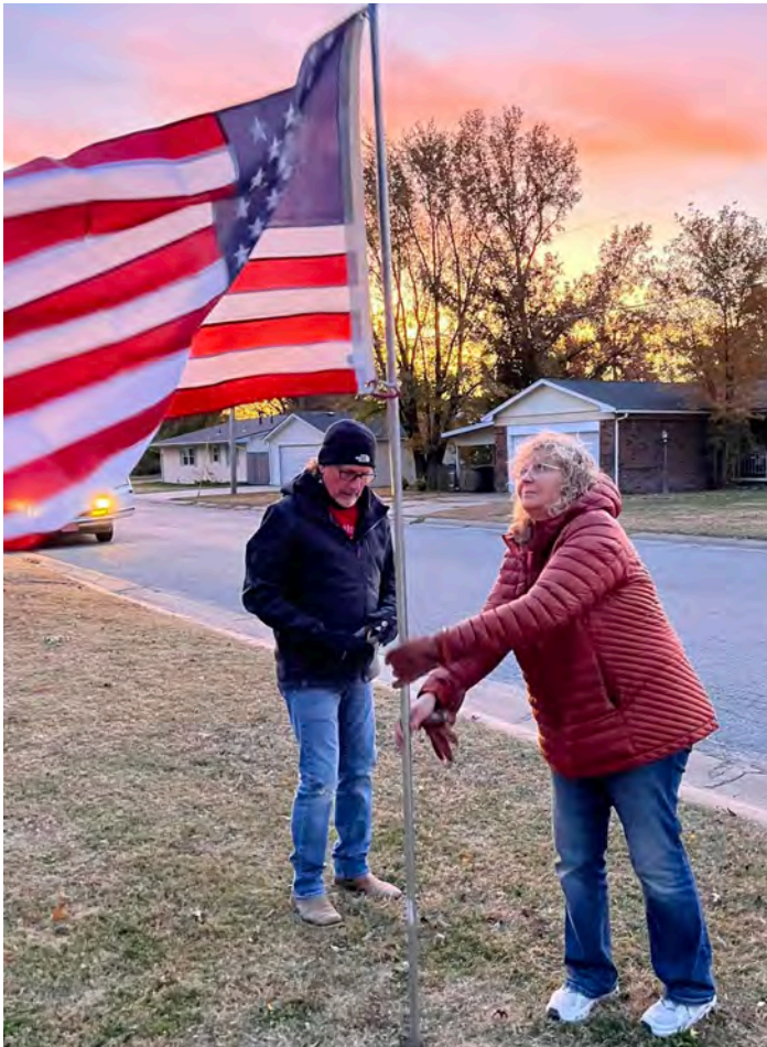
Wellington Lions were up early on Veteran's Day, placing flags in yards around the community.