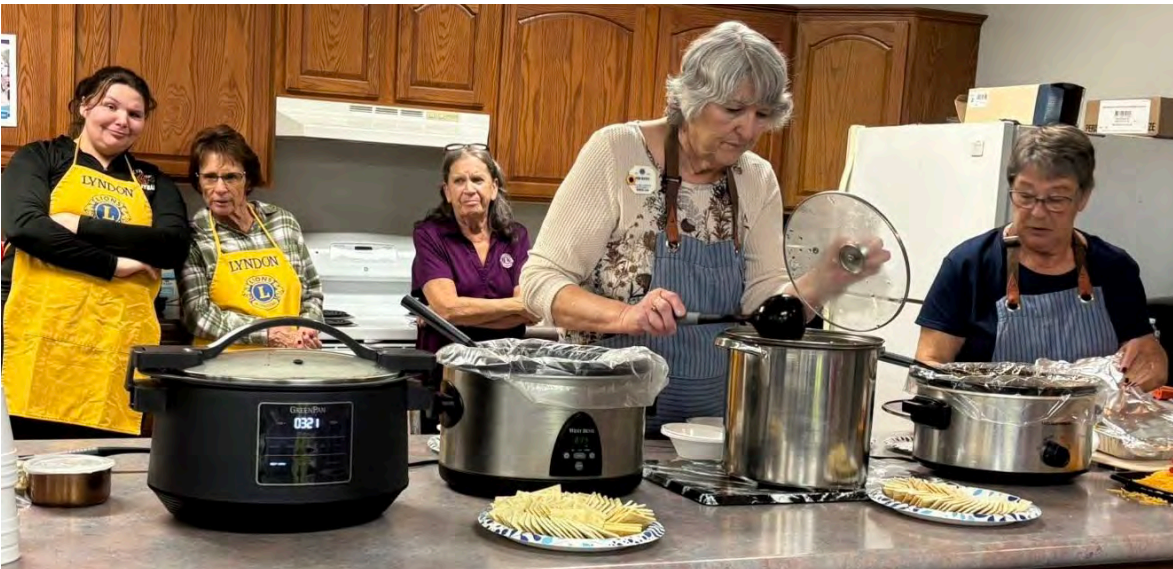
First responders with the Lyndon Fire Department and EMTs, Lyndon Police Department and Osage County Sheriff's Department were guests at a Soup Supper hosted by the Lyndon Lions Club.