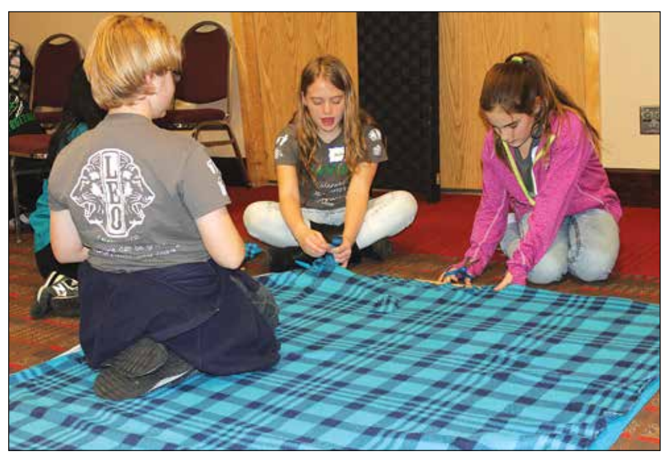
Kansas Leos made blankets at Mid-Winter Rally for pediatric cancer patients.

Registration is due in June so please send your donations soon. The youth