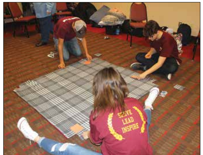
Kansas Leos work on a service project of tied blankets.