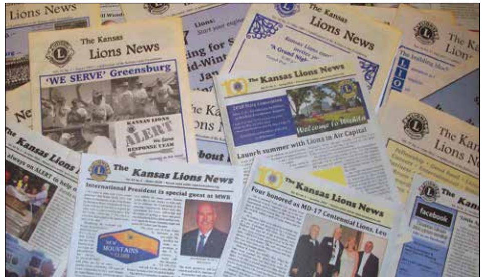
The Kansas Lions News has come a long way since its inception.