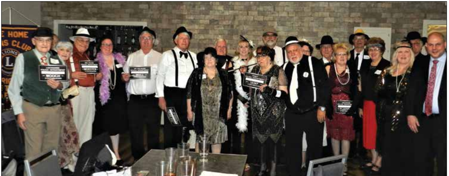
Lions and guests got into the spirit of the evening at the "Roaring '20s" party during the District K convention in March in Hays.