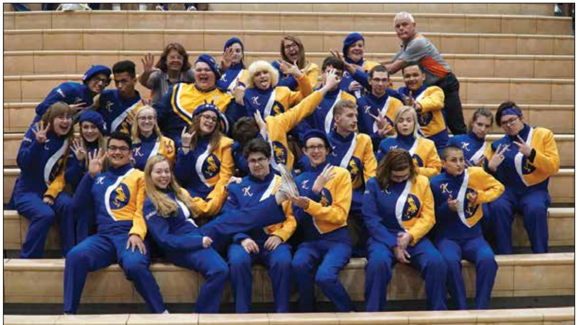
The 2019 four-year band students are pictured here before last year's concert. Several who would have been eligible to return in 2020 will be honored as five-year band participants, even though this year's band camp was cancelled due to the coronavirus.