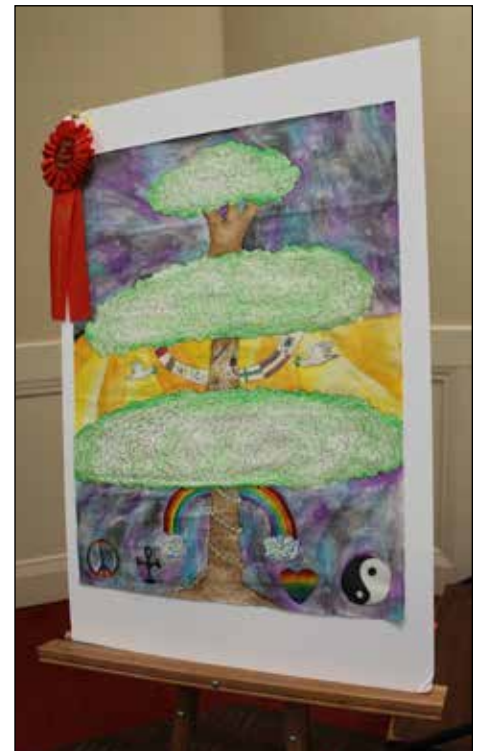
The second place poster was created by Lyssa Bushy of Dighton.