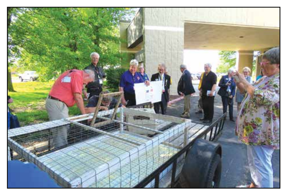
Kansas Lions News • Summer 2019 • Page 16 _____

Non-Profit Standard U.S. Postage PAID Permit No. 300 Wichita, KS. 67276