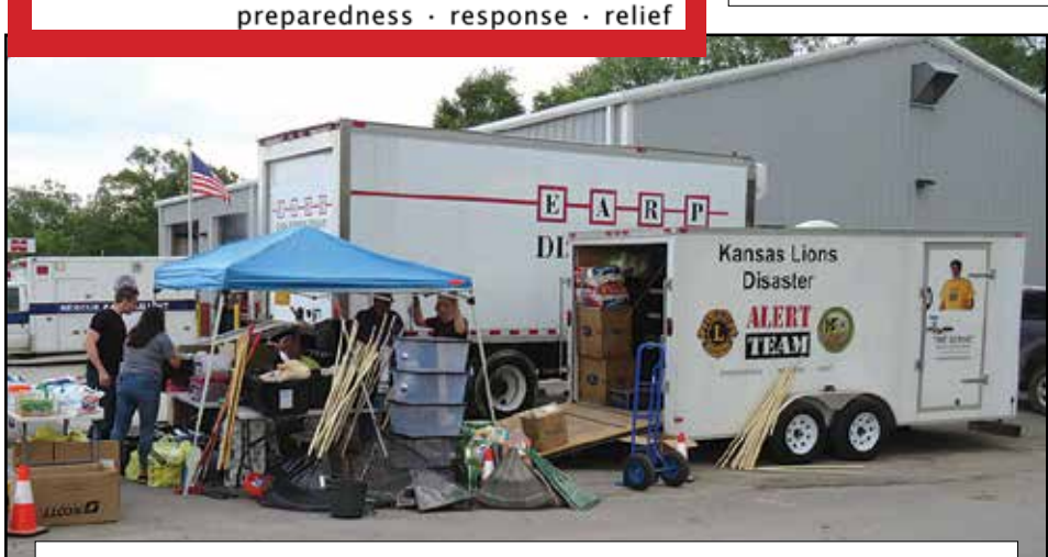
The MD-17 ALERT Trailer set up at the Linwood Fire House, which became the Command Center after the tornado.