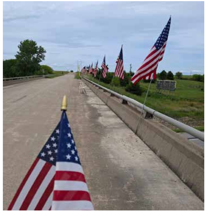
Emporia Lions had some help putting up flags along an I-35 overpass on Flag Day, Saturday, June 14.