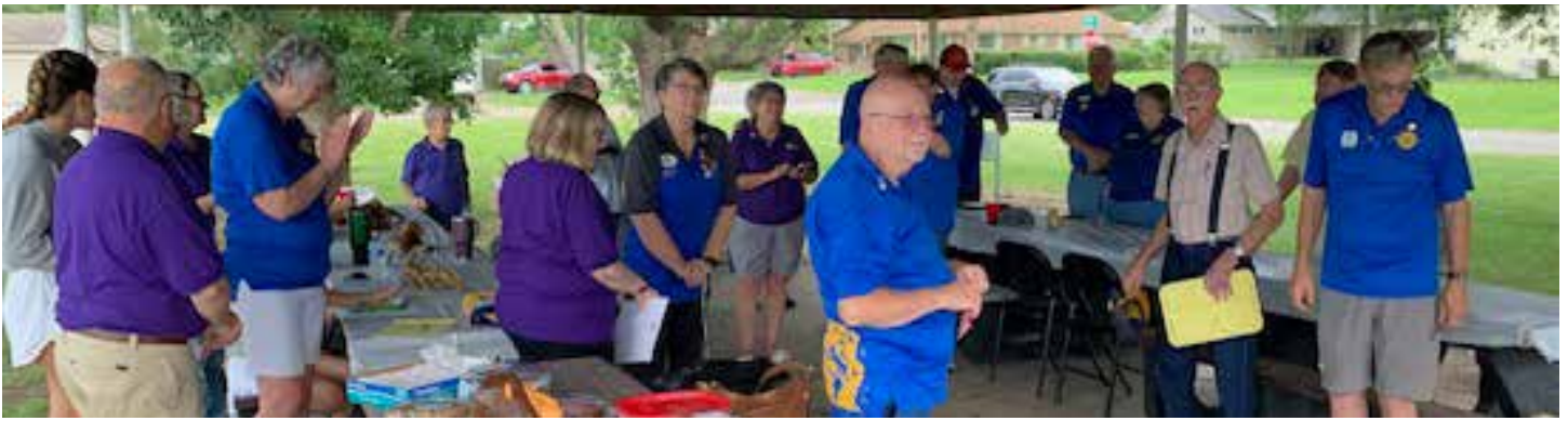
Lions from across District 17N attended Charter Night for the new Augusta Servant Lions Club.