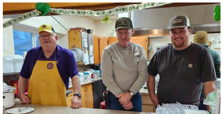
Hillsboro Lions ready to serve up some pancakes!