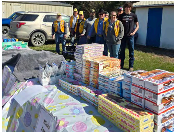
Westphalia Lions hosted the annual community Easter Egg Hunt on March 28.