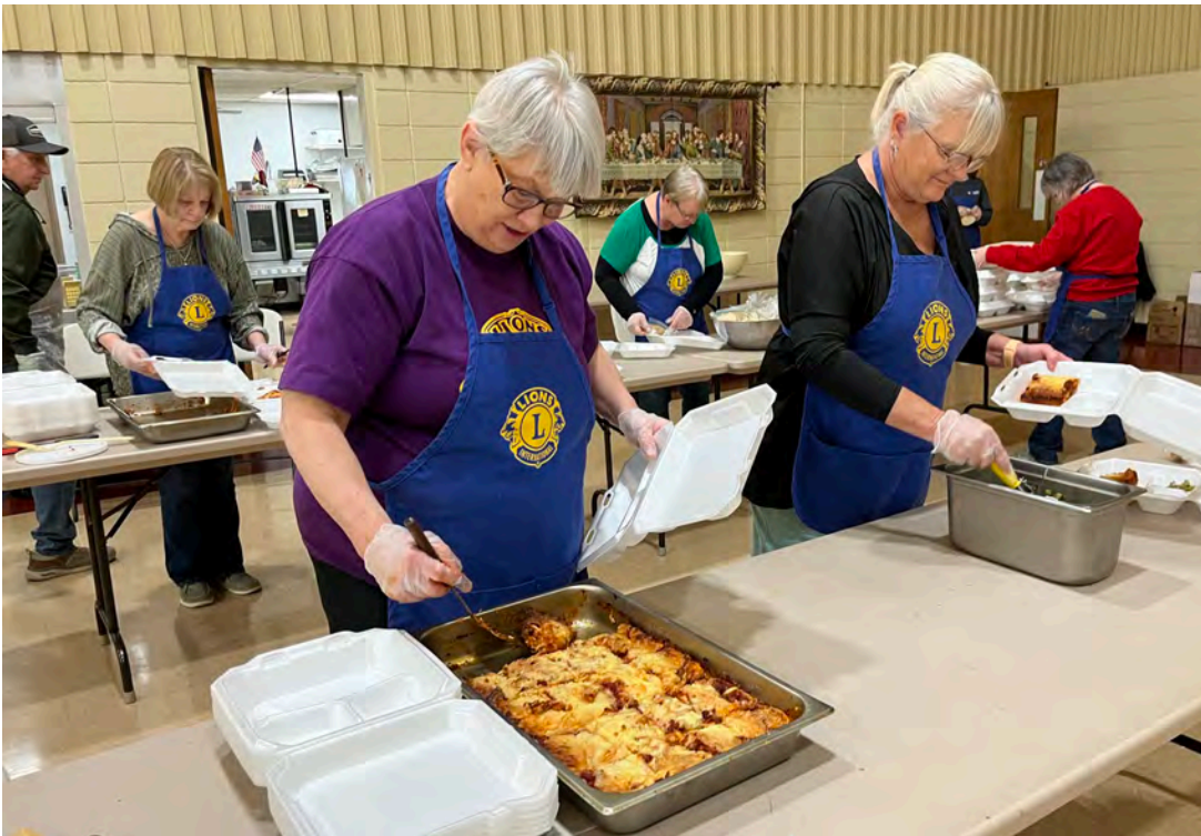
A lotta pasta Girard Lions served up about 450 slices of lasagna for the club's annual fundraiser on March 18.