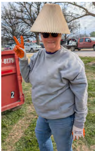
Wellington Lions helped with a community clean-up and had a little fun too!