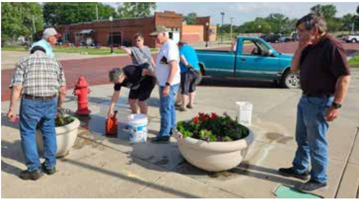
Above: Augusta Lions participated in "Fill A Pot" in Downtown Augusta