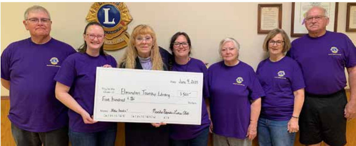
Neosho Rapids Lions Club donated $500 to Elmendaro Township Library, located in Hartford.