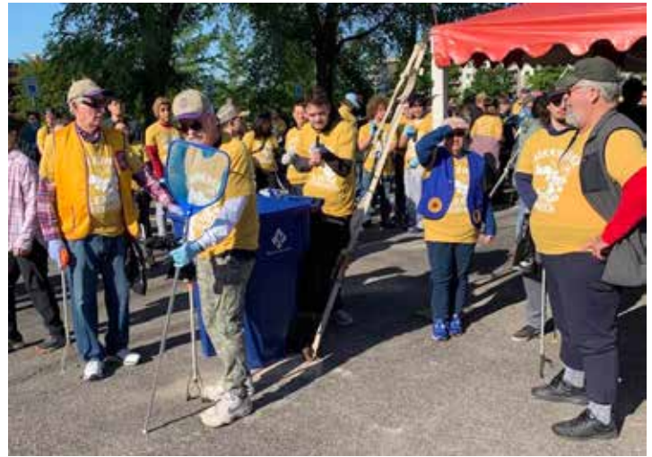
Right: Wichita Downtown Lions volunteered for the Arkansas River Clean-up.