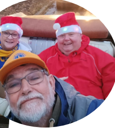
Holton Christmas Parade