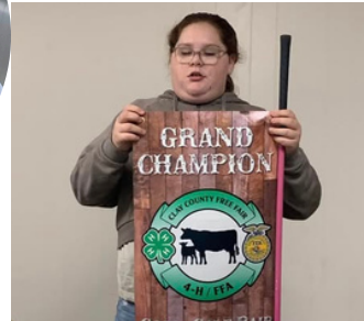
Morganville Lions presentation from local 4-H members