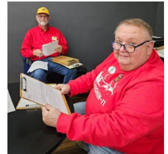
Vision Screening in Holton