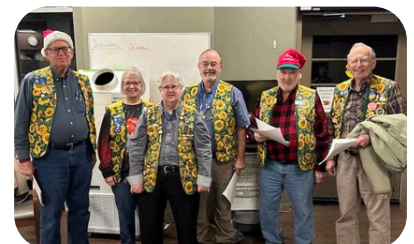
Caroling at the Topeka VA Hospital