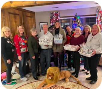
Topeka Lions Christmas Party and Cookie Assembly