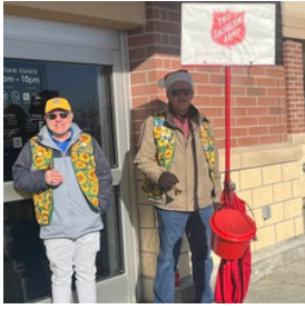
Salvation Army Bell Ringing