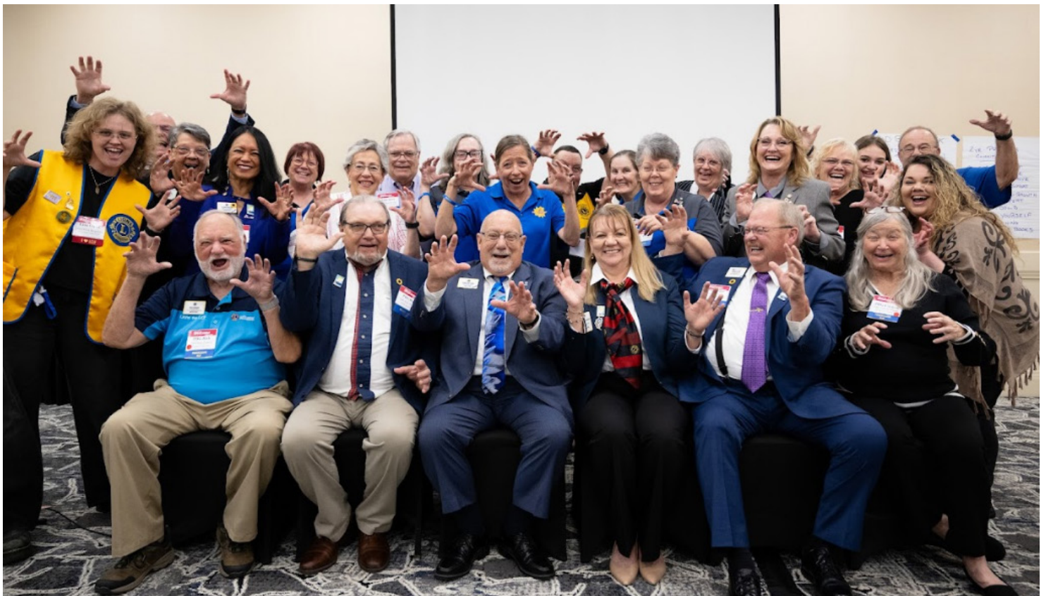
Graduates of the Certified Guiding Lions Training and Facilitators! Roar Lions!