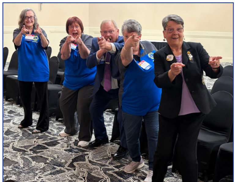
Stretch and movement during the Guiding Lions Training