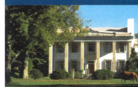
Belle Meade Historic Site & Winery.