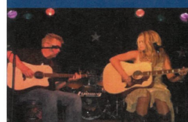
Nashville Nightlife Dinner Theater.