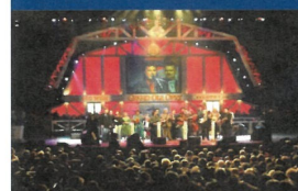
Famous Grand Ole Opry.

Departure: The 911 Building, 144 South Main St, Mount Gilead, OH @ 8 am