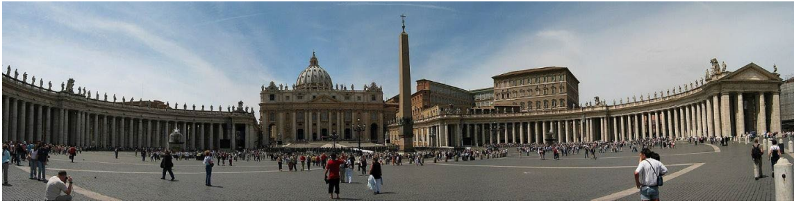
23. Saint Peter Basilica.