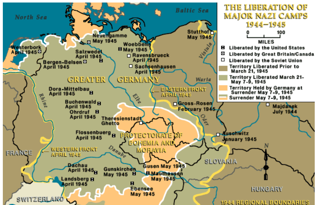
19. Major Nazi Concentration Camps in Europe 1944-1945

Jewish men from Subcarpathian Rus await selection on the ramp at Auschwitz-Birkenau