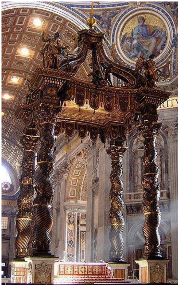
24. Altar in Saint Peter's Basilica. By Ricardo André Frantz (User:Tetraktys) - http://commons.wikimedia.org/wiki/File:Interiorvaticano8.jpg , CC BY-SA 2.5

File:Vatican StPeter Square.jpg - Wikimedia Commons