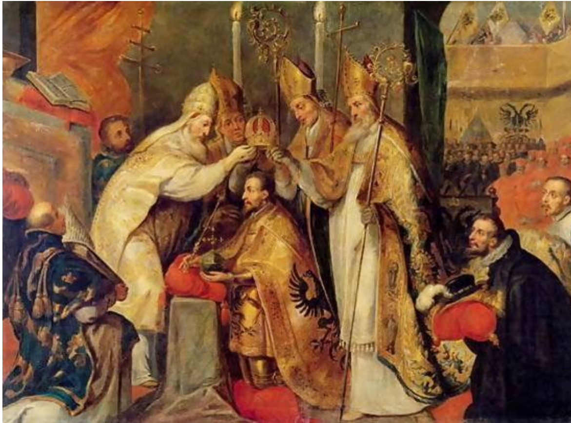
12. Charles V Coronation, 1519. The Harlot endorsing The Beast.