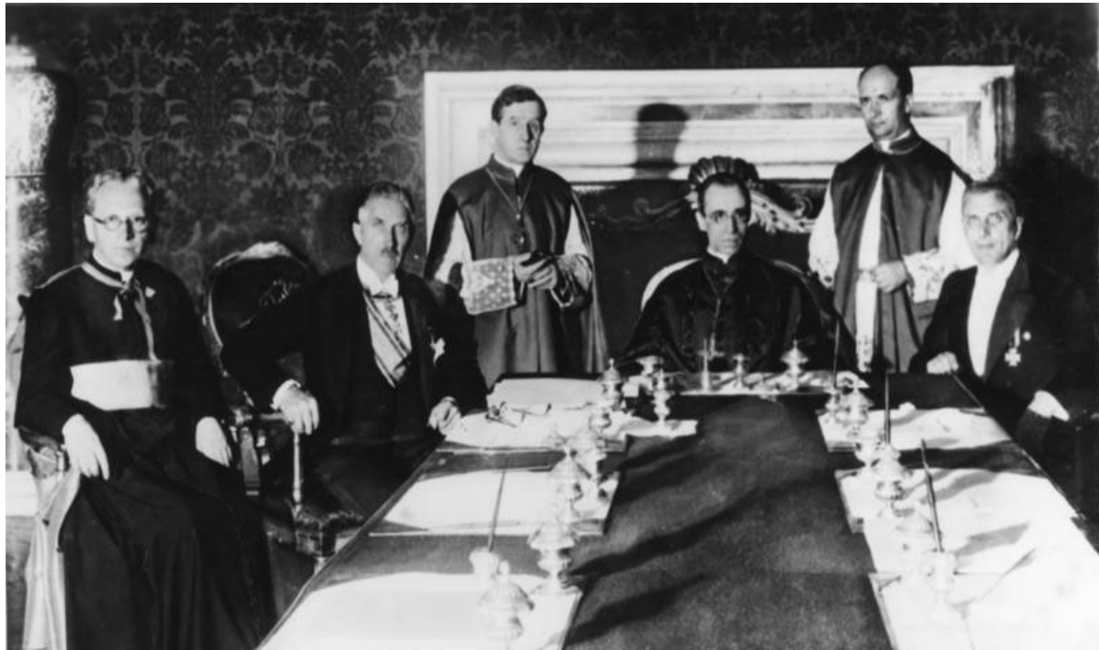
16. Germany-Vatican Concordat Signature, July 20, 1933. By Bundesarchiv, Bild 183-R24391 / Unknown / CC-BY-SA 3.0, CC BY-SA 3.0 de.

Wikimedia.org Concordat signing in Rome. - On July 20, 1933