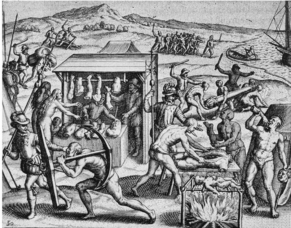
13. The Spaniards' Atrocities in the Americas.

Ranker.com 15 Brutal Ways Conquistadors Killed Native People