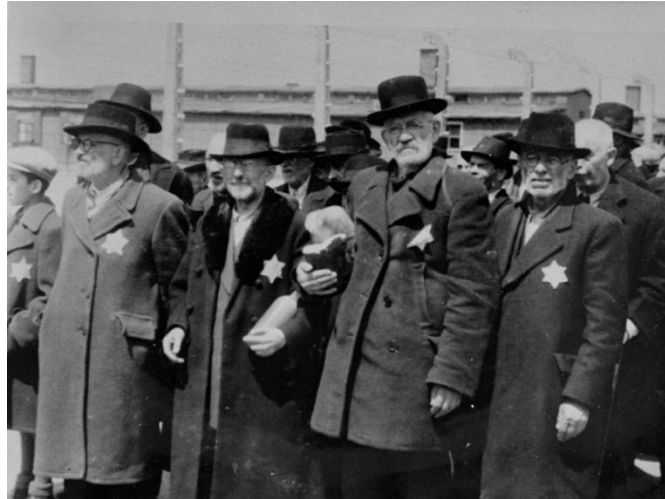
18. Jewish men from Subcarpathian Rus await selection on the ramp at Auschwitz-Birkenau.

Jewish men from Subcarpathian Rus await selection on the ramp at Auschwitz-Birkenau