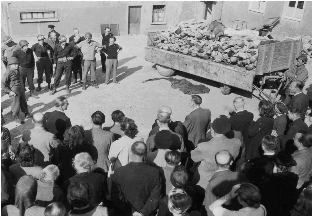
22. U.S. soldiers confront German citizens with the corpses found at Buchenwald. April 18, 1945. By Walter Chichersky, U.S. Signal Corps – National Archives Washington, via the "Stiftung Gedenkstätten Buchenwald und Mittelbau-Dora" (Buchenwald and Mittelbau-Dora Memorials Foundation).

Wikimedia.org Buchenwald -Nazi Conc. Camp