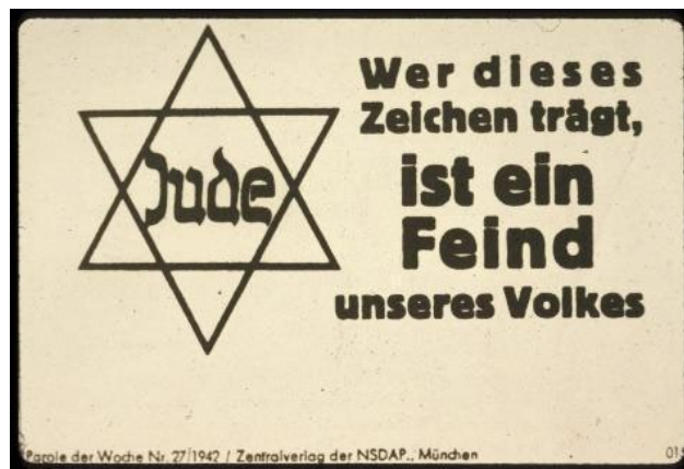
17. Nazi propaganda poster with a picture of a Jewish star and a German caption that reads, "Whoever wears this symbol is an enemy of our Volk ( people )."

Concordat signing in Rome. - On July 20, 1933