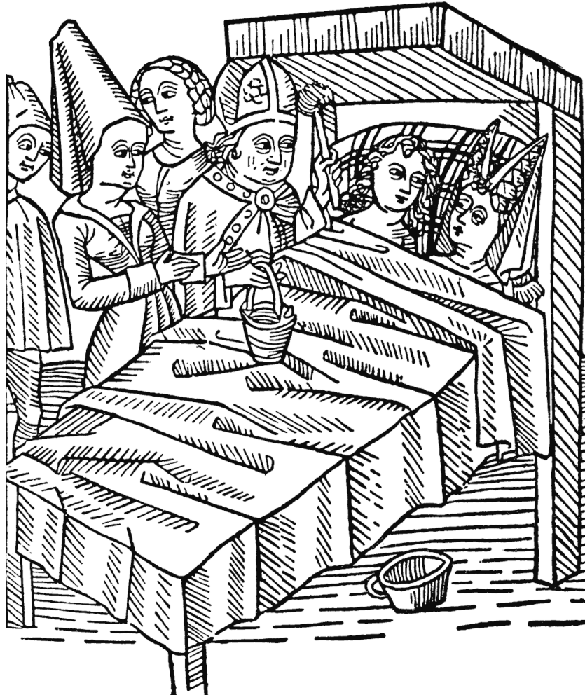
25. Babylonian Marriage. How Reymont and Melusina were betrothed/ And by the bishop were blessed in their bed on their wedlock. (Woodcut from The Fair Melusina /15 th century.)

File: Brauysegen im Bett.gif - Wikipedia