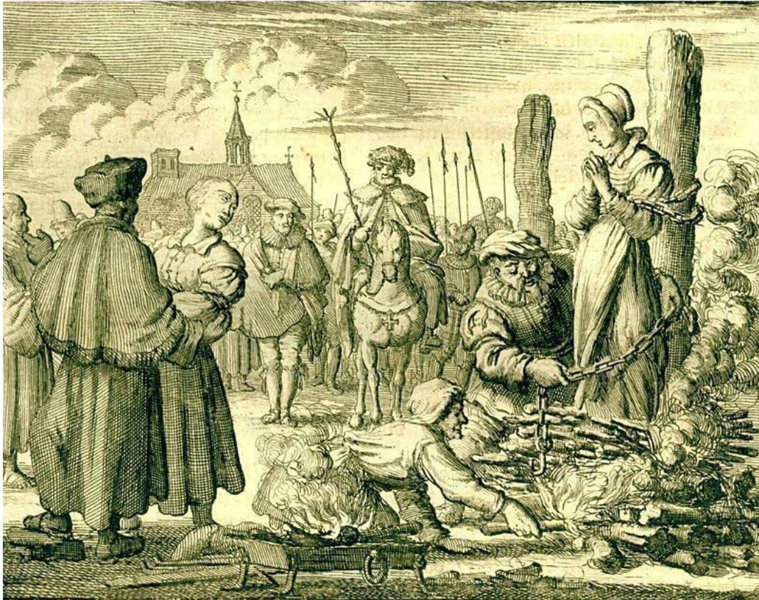
10. Spanish Inquisition Against Jews and “Heretics”. Middle Ages.

Revisiting Jewish and Islamic Oppression during the Spanish Inquisition