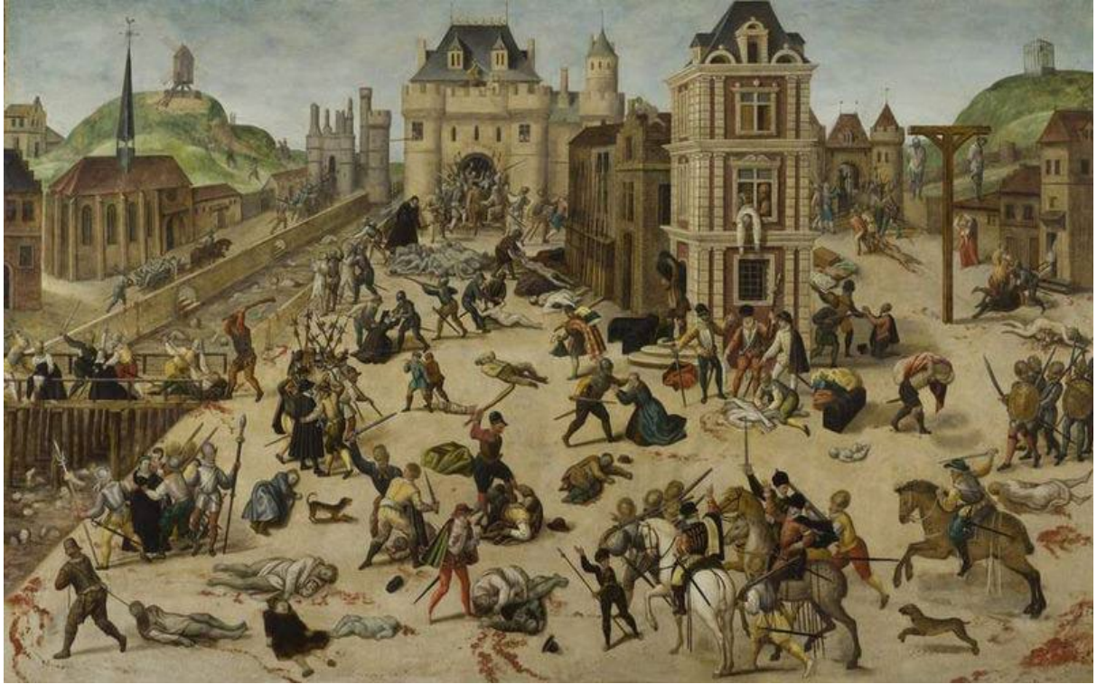
4. 1209-1229 A.D. Crusade against the Albigensians (Cathars). Massacre of Saint Bartholomew, Southern France.