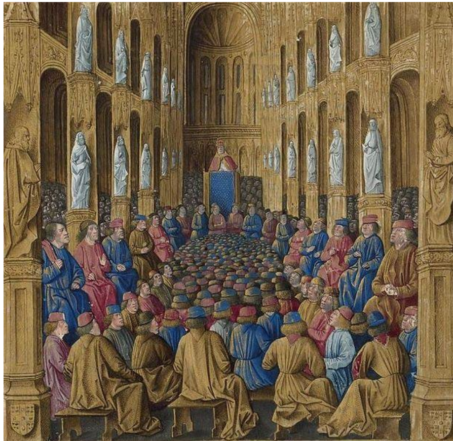
2. First Crusade to Jerusalem (1096 AD.) Pope Urban II'S Appeal for troops. Counsel of Clermont. By Jean Colombe. Public Domain.