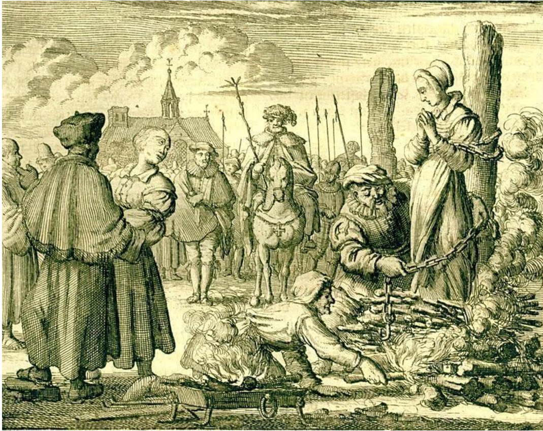
10. Spanish Inquisition Against Jews and “Heretics”. Middle Ages.