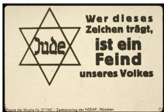
17. Nazi propaganda poster with a picture of a Jewish star and a German caption that reads, "Whoever wears this symbol is an enemy of our Volk ( people )."

https://collections.ushmm.org/search/catalog/pa115552