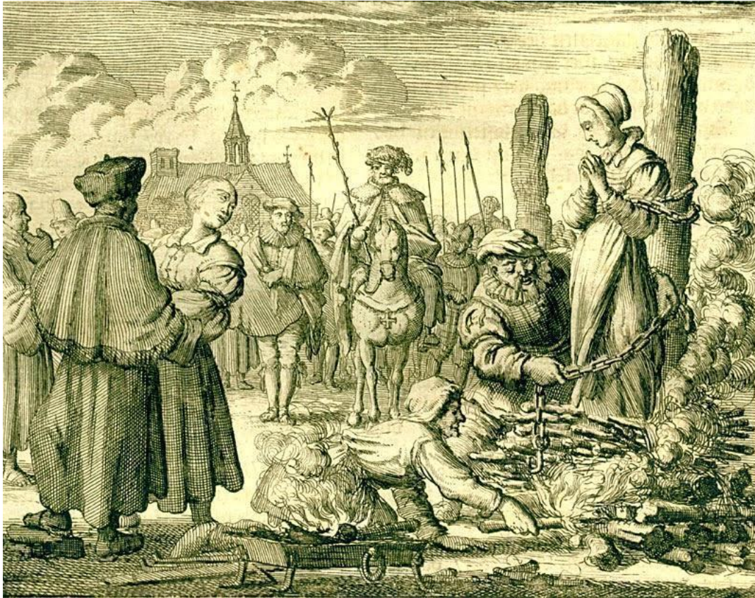
10. Spanish Inquisition Against Jews and “Heretics”. Middle Ages. http://eirael.blogspot.mx/2014/05/revisiting-jewish-and-islamic.html