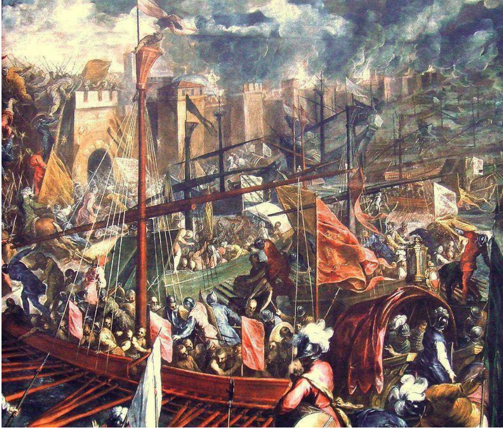
3. The Fourth Crusade (1204 AD.) Against Constantinople By Palma Le Jeune (1544–1620)