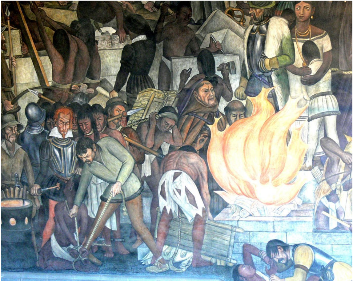
15. The Spanish burning Mayan written materials; Massacre and Enslavement. https://commons.wikimedia.org/wiki/File:Murales_Rivera_-_Treppenhaus_9_B%C3%BCcherverbrennung.jpg