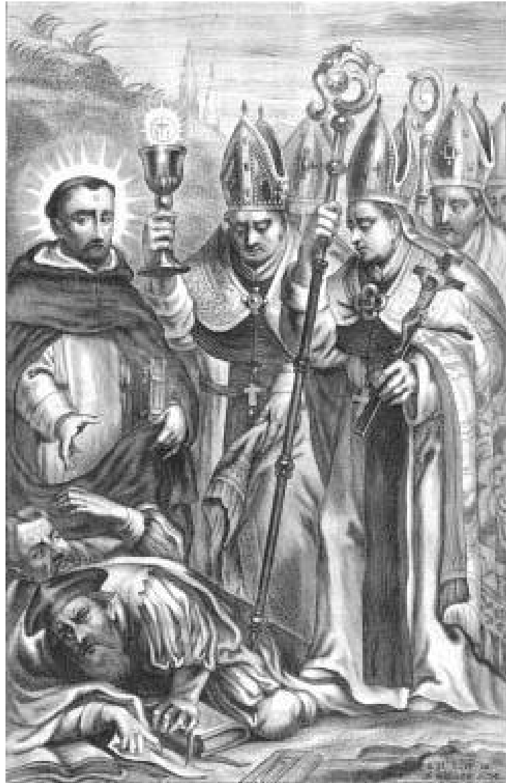
5. Albigensians/Cathars (Southern France) underfoot. http://www.cathar.info/cathar_catholic.htm