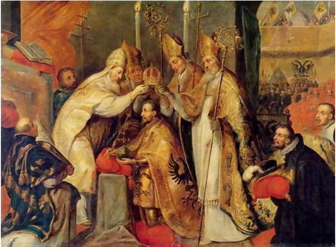
12. Charles V Coronation, 1519. The Harlot endorsing The Beast. https://www.pinterest.co.uk/pin/799811215048363493/