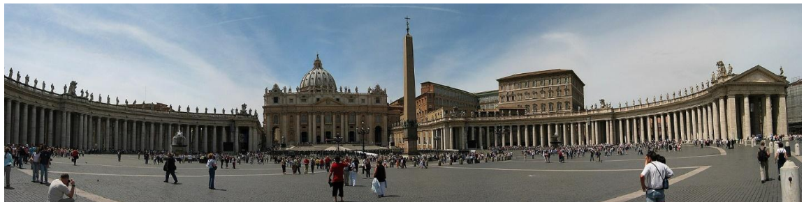
24. Saint Peter Basilica.