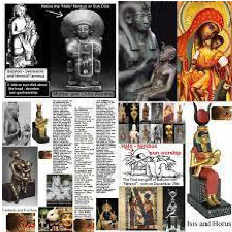
23. Images of the (Babylonian) Virgin and Son idol in different cultures. https://worldsymbolsblog.wordpress.com/2015/04/03/the-origins-of-passover-and-easter/