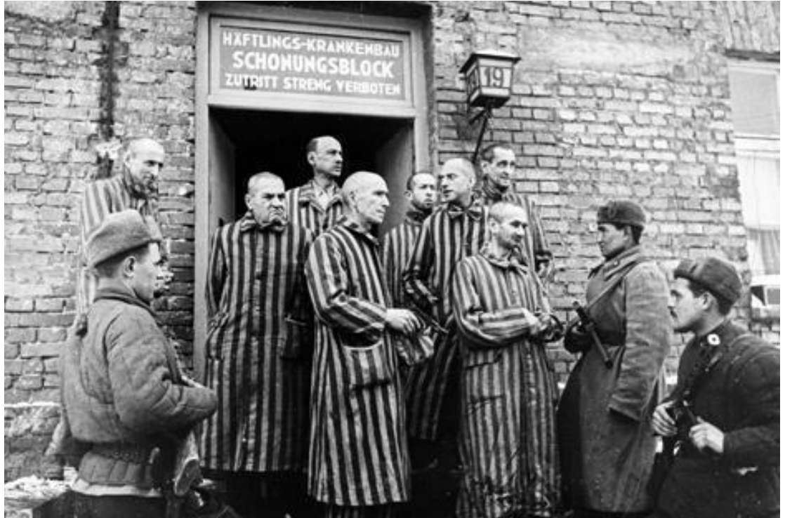
21. Soviet soldiers liberating victims of Auschwitz Concentration Camp, 1945. https://www.rbth.com/arts/2015/01/27/memories_of_the_liberation_of_auschwitz_41045