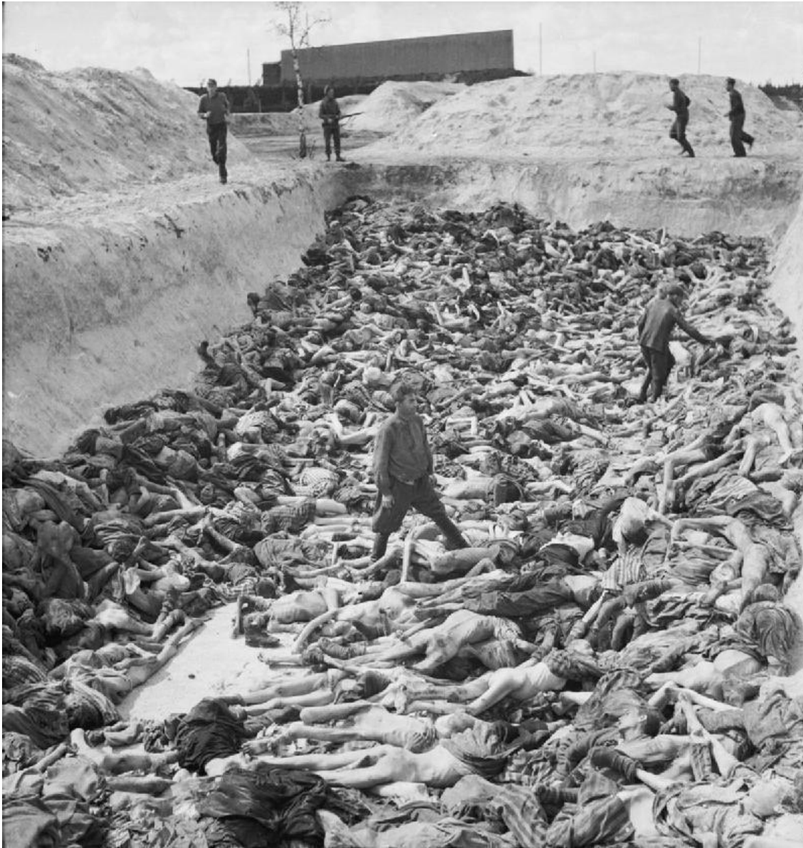
20. The Liberation of Bergen-belsen Concentration Camp, Germany. 1945. https://en.wikipedia.org/wiki/File:The_Liberation_of_Bergen-belsen_Concentration_Camp,_April_1945_BU4260.jpg