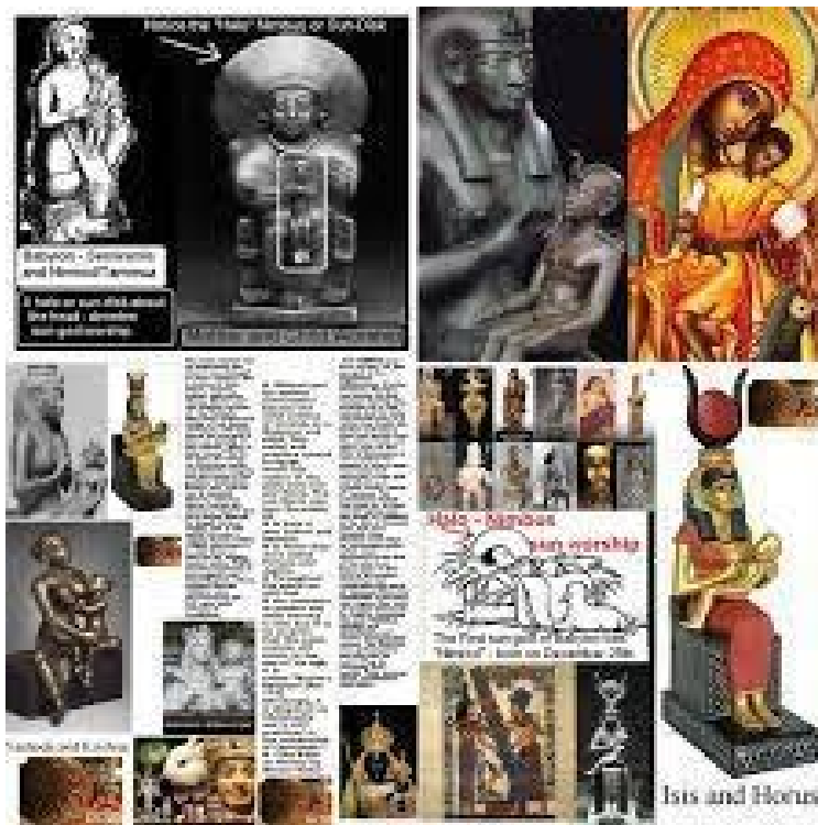
23. Images of the (Babylonian) Virgin and Son idol in different cultures.

https://worldsymbolsblog.wordpress.com/2015/04/03/the-origins-of-passover-and-easter/