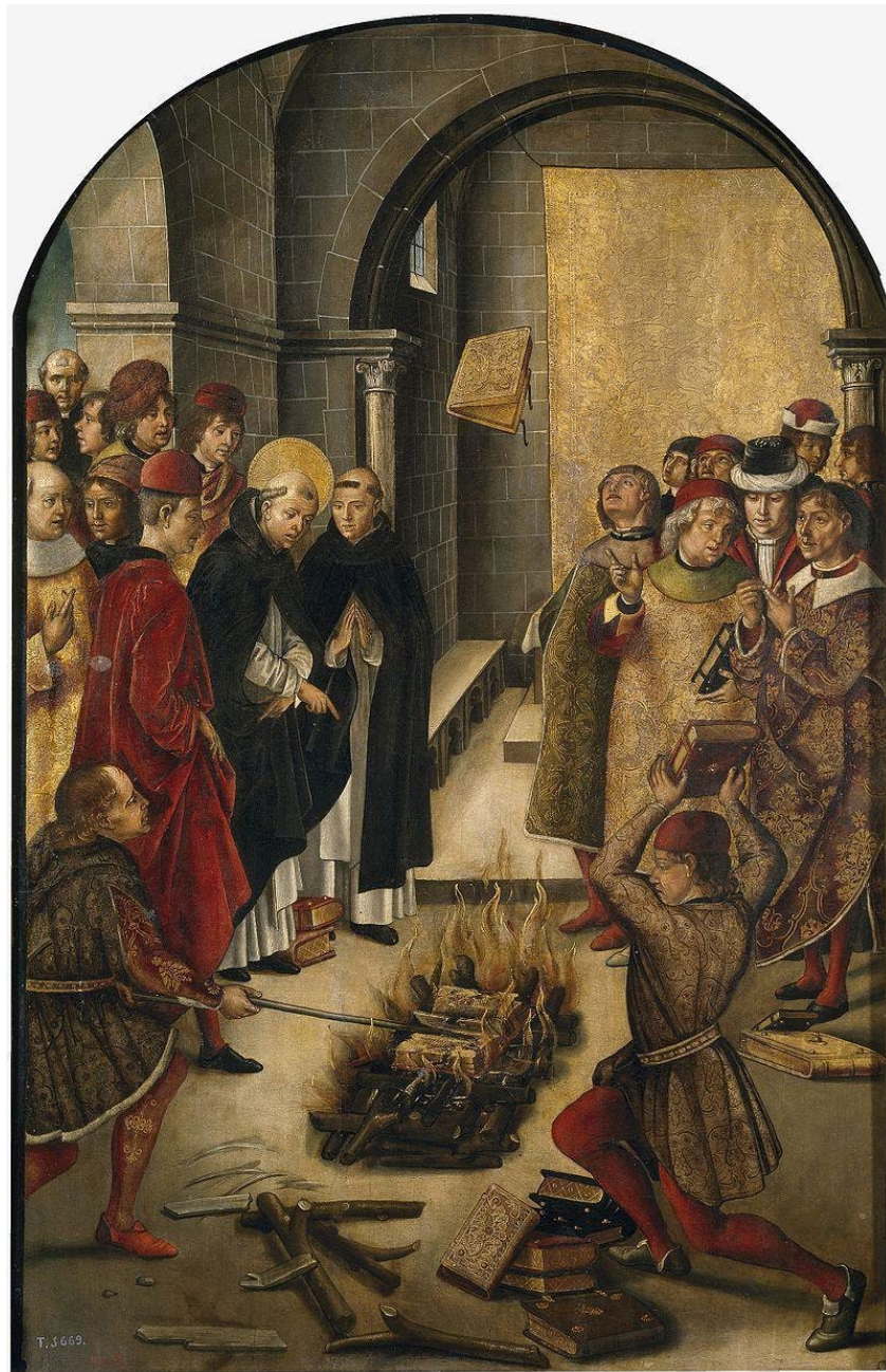
11. Burning of Albigensian Books, Middle Ages. By Pedro Berruguete - Prado, Public Domain, https://commons.wikimedia.org/w/index.php?curid=430020