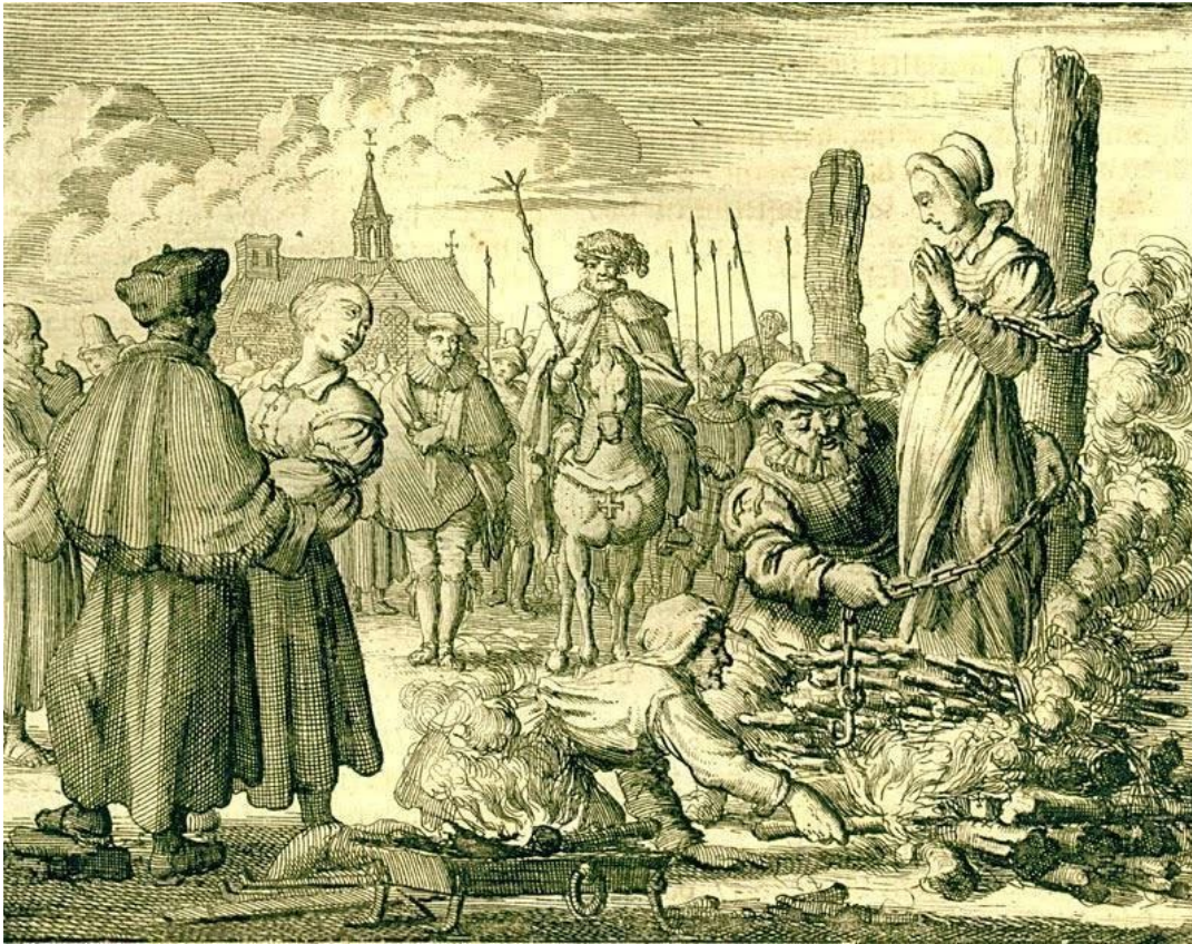
10. Spanish Inquisition Against Jews and “Heretics”. Middle Ages.