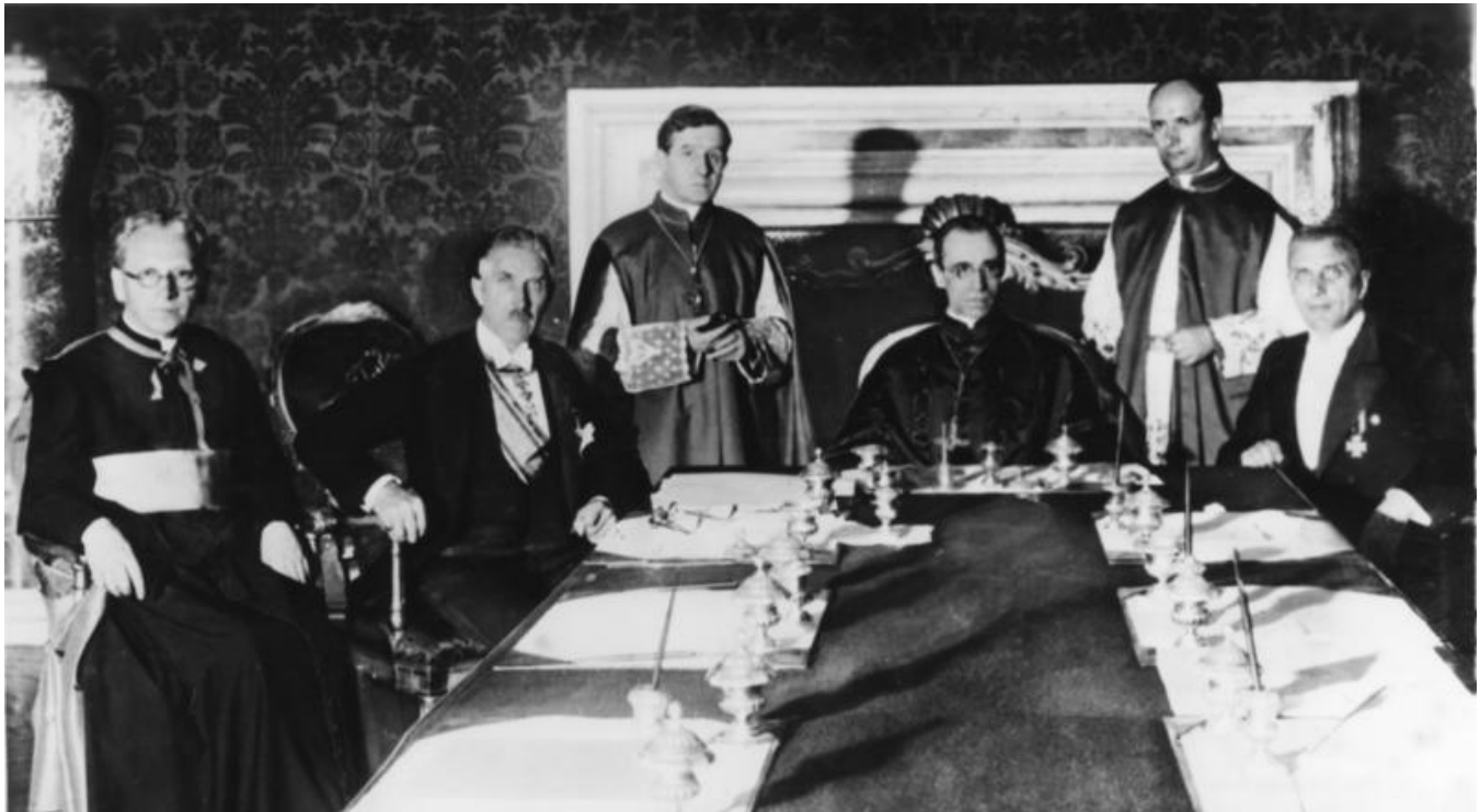
16. Germany-Vatican Concordat Signature, July 20, 1933.