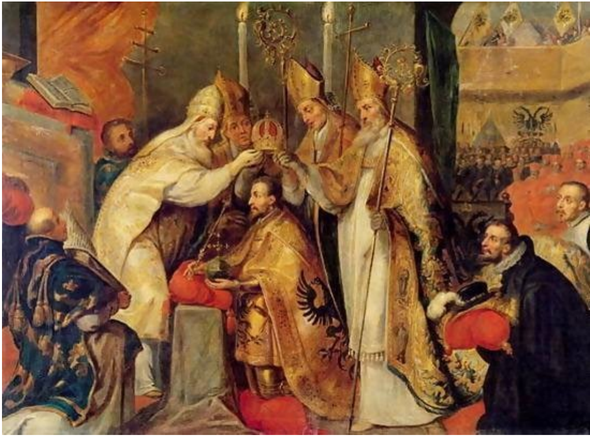
12. Charles V Coronation, 1519. The Harlot endorsing The Beast. https://www.pinterest.co.uk/pin/799811215048363493/