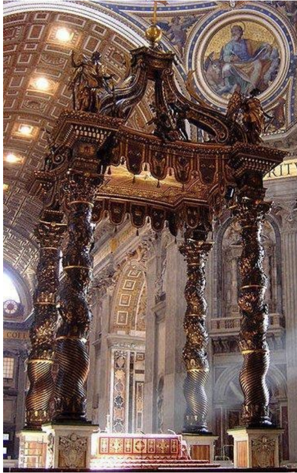
25. Altar in Saint Peter's Basilica. By Ricardo André Frantz (User:Tetraktys) - http://commons.wikimedia.org/wiki/File:Interiorvaticano8.jpg , CC BY-SA 2.5, https://commons.wikimedia.org/w/index.php?curid=7272169