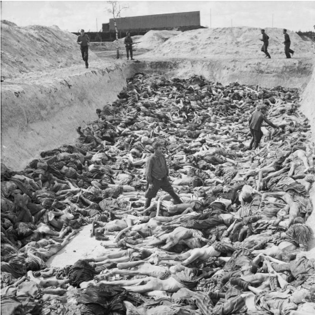
20. The Liberation of Bergen-belsen Concentration Camp, Germany. 1945. https://en.wikipedia.org/wiki/File:The_Liberation_of_Bergen-belsen_Concentration_Camp,_April_1945_BU4260.jpg