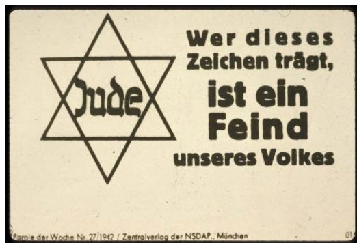
17. Nazi propaganda poster with a picture of a Jewish star and a German caption that reads, "Whoever wears this symbol is an enemy of our Volk ( people ).".