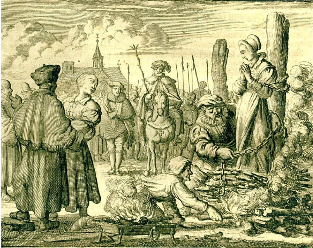
10. Spanish Inquisition Against Jews and “Heretics”. Middle Ages.