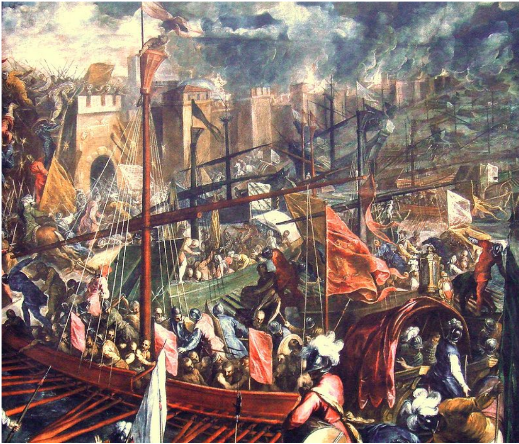
3. The Fourth Crusade (1204 AD.) Against Constantinople By Palma Le Jeune (1544–1620) - Lebedel, Claude (2006) Les croisades, origines et consequences, Ouest-France ISBN: 978-2-7373-4136-6.