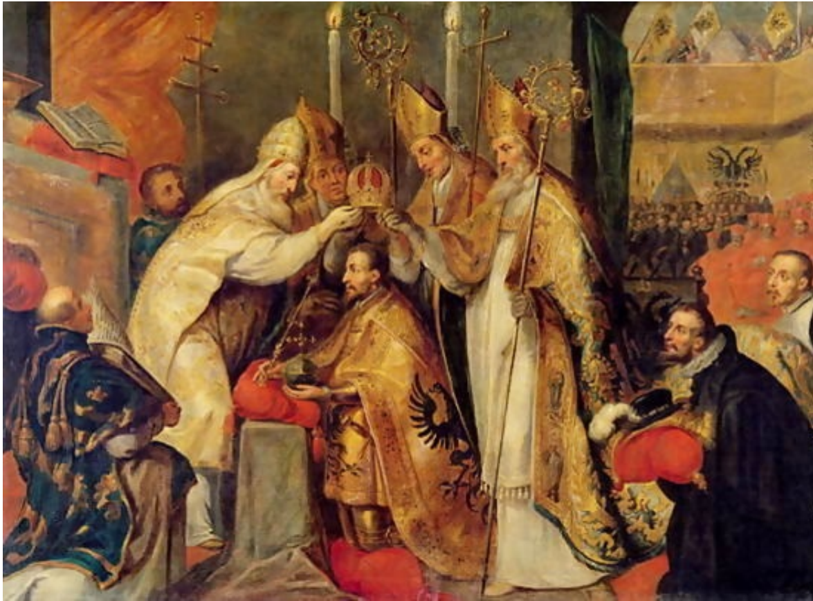
12. Charles V Coronation, 1519. The Harlot endorsing The Beast.