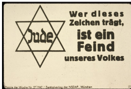
17. Nazi propaganda poster with a picture of a Jewish star and a German caption that reads, "Whoever wears this symbol is an enemy of our Volk ( people )."