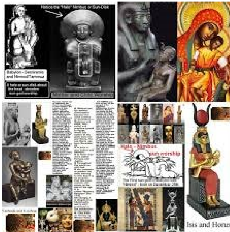
23. Images of the (Babylonian) Virgin and Son idol in different cultures.

https://worldsymbolsblog.wordpress.com/2015/04/03/the-origins-of-passover-and-easter/