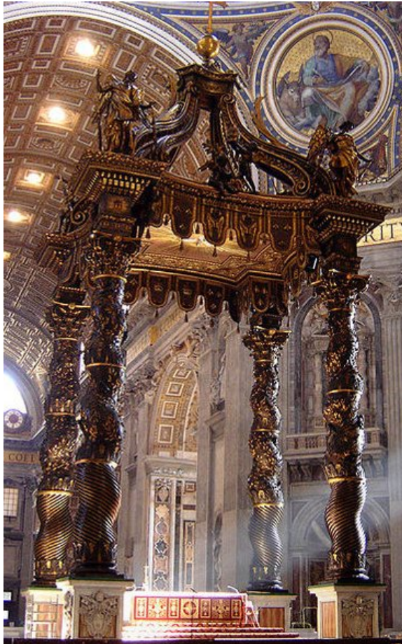
25. Altar in Saint Peter's Basilica. By Ricardo André Frantz (User:Tetraktys) - http://commons.wikimedia.org/wiki/File:Interiorvaticano8.jpg , CC BY-SA 2.5, https://commons.wikimedia.org/w/index.php?curid=7272169