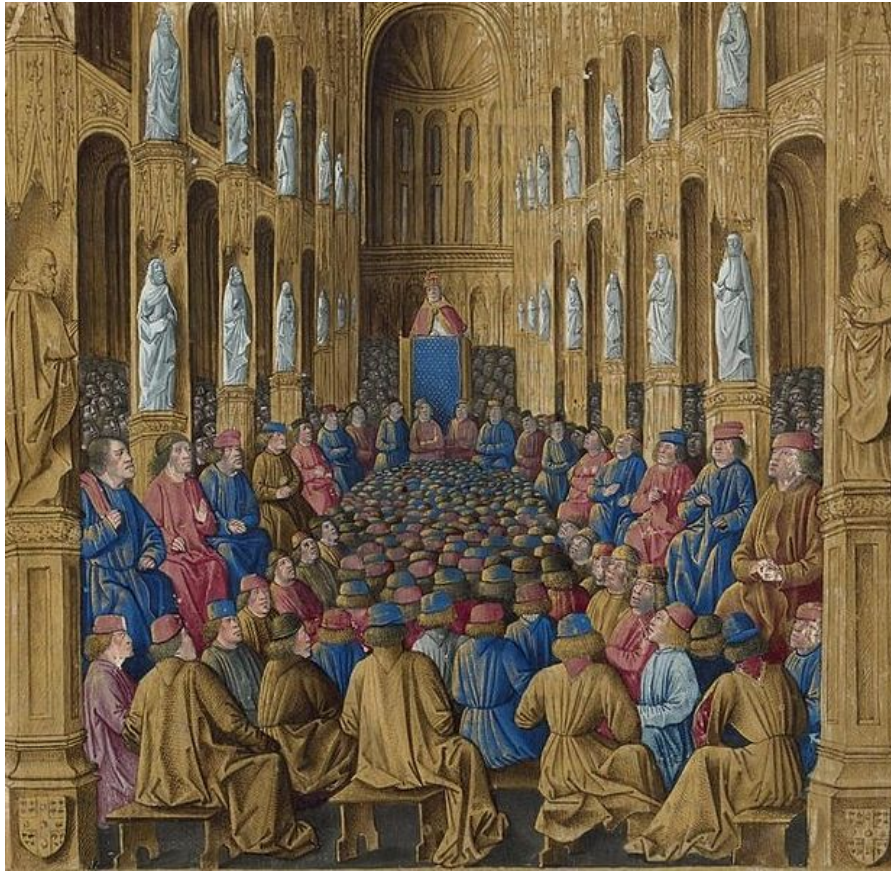
1. First Council of Nicaea (325 AD).

https://upload.wikimedia.org/wikipedia/commons/4/4f/Nicea.jpg