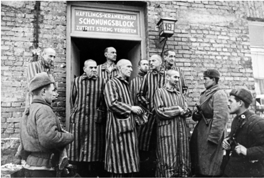
21. Soviet soldiers liberating victims of Auschwitz Concentration Camp, 1945.

https://www.rbth.com/arts/2015/01/27/memories_of_the_liberation_of_auschwitz_41045