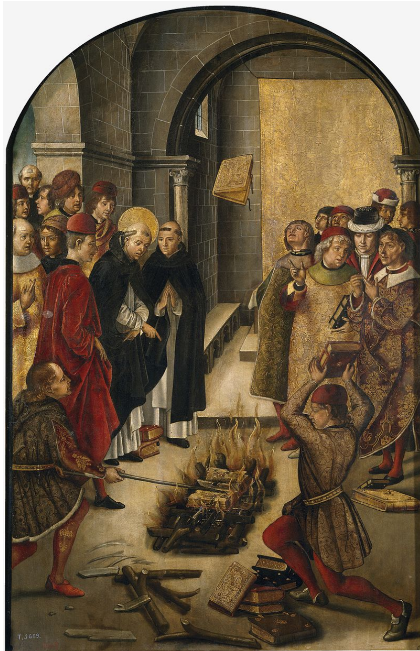
11. Burning of Albigensian Books, Middle Ages. By Pedro Berruguete - Prado, Public Domain, https://commons.wikimedia.org/w/index.php?curid=430020