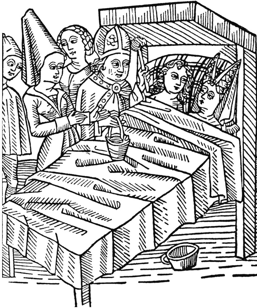
26. Babylonian Marriage. How Reymont and Melusina were betrothed / And by the bishop were blessed in their bed on their wedlock. (Woodcut from The Fair Melusina /15 th century.) Public Domain. https://en.wikipedia.org/wiki/File:Brauysegen_im_Bett.gif