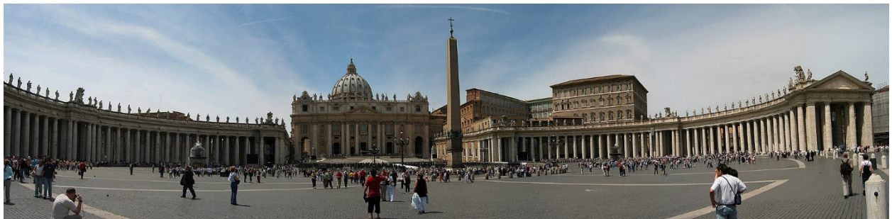
24. Saint Peter Basilica. By I, Dfmalan, CC BY-SA 3.0,

https://worldsymbolsblog.wordpress.com/2015/04/03/the-origins-of-passover-and-easter/