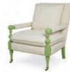
8195 Bradstreet Chair Benjamin Moore #538 Vienna Green p.219

Benjamin Moore paint colors can be requested on any frame featuring exposed wood. Additional charges are style specific, so refer to the individual style in the price list. Benjamin Moore paint decks can be obtained through a local retailer or online at benjaminmoore.com . Finishes shown may vary from actual finish due to the printing process.