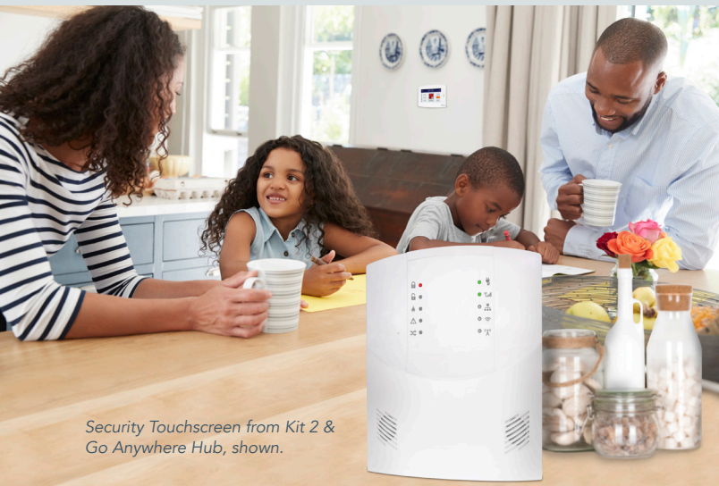
Security Touchscreen from Kit 2 & Go Anywhere Hub, shown.