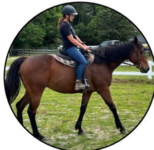
Dreaming of Carats

Dreaming of Carats (Doc) is a 6-year-old thoroughbred. He's handsome to look at, quiet and kind, and a beautiful mover to boot.