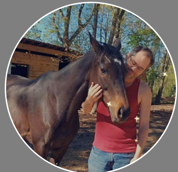
Classy and Rich