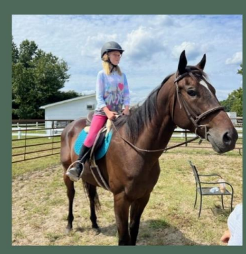
FIREY WIND Wind is a coming 4-year-old unraced gelding. He has a good brain and is currently W/T/C, although his training continues.