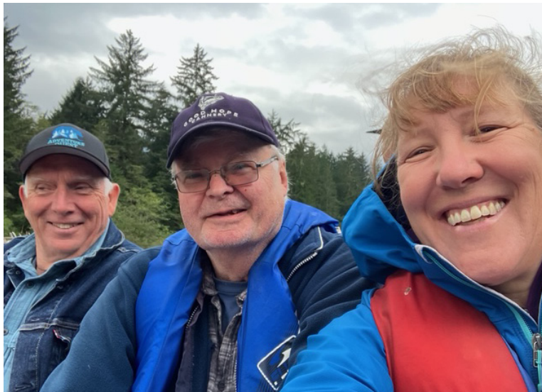
Three of us, after working in Philips Arm on chinook tagging project