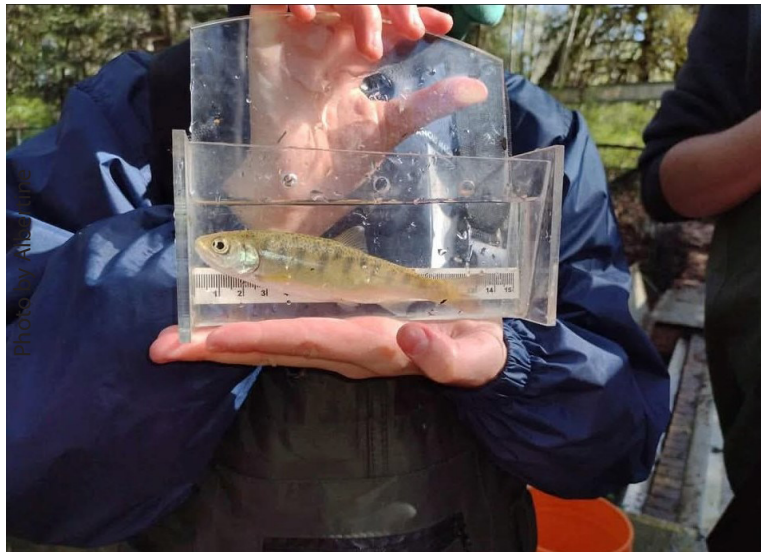
Smolt release 2025