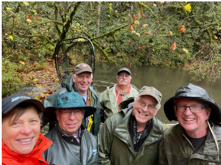
Coho egg take crew starting day on trap 3

We must give thanks to the legal firm of Tees Kiddle Spenser "TKS" who have participated in the building of the fund by offering estate planning (wills) at a major reduction of fees.