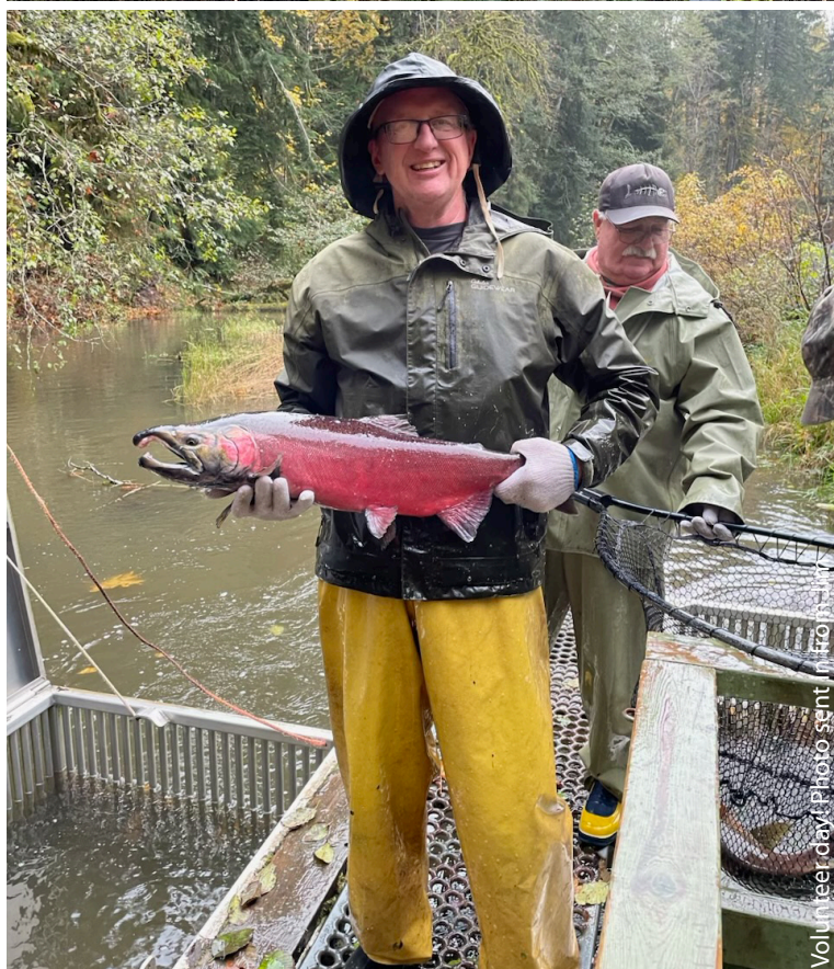
Volunteer Day Photo sent in from...