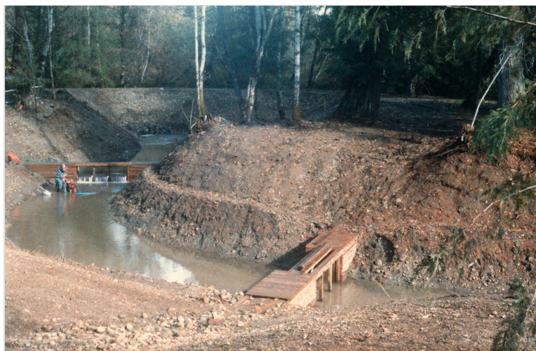
How far we've come! A step back in time - channel #1 - Coho rearing pond Read about our history https://oysterriverenhancement.org/our-history