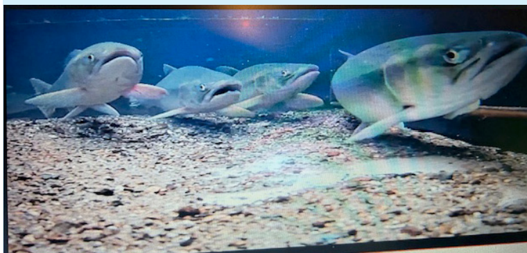
Cam 3 - pink salmon on the laptop passing through the trap

Lyle's plan was to count the pinks coming through the traps by turning on the cameras, opening the gates and letting the pinks swim through on their own without netting them. This would both save everyone's backs for too much dipnetting, and be much less harmful to the fish.