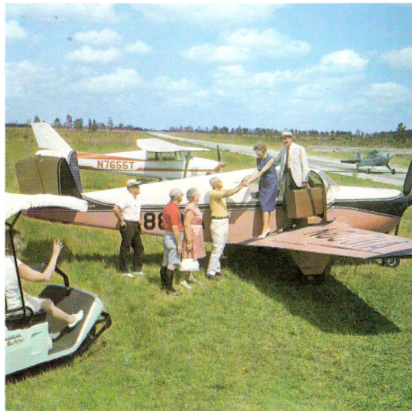
Sun City has its own airport