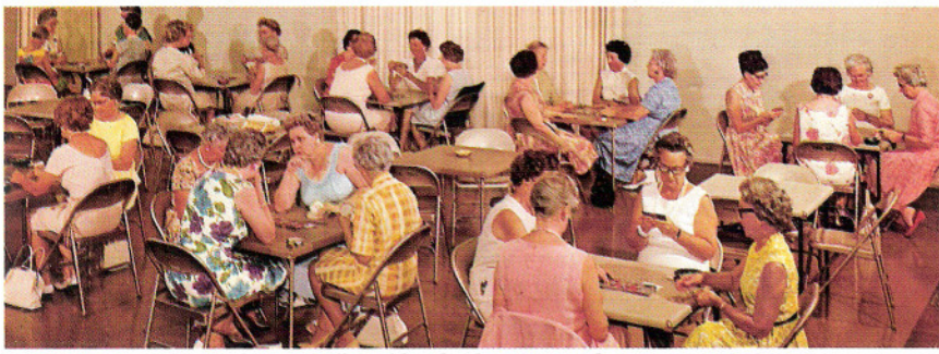
Bridge anyone? Card players will find kindred spirits in the many card clubs