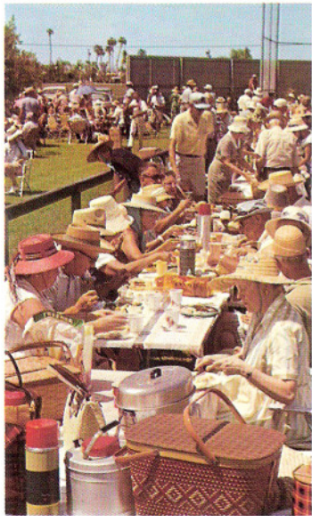
Picnics with friends are fun