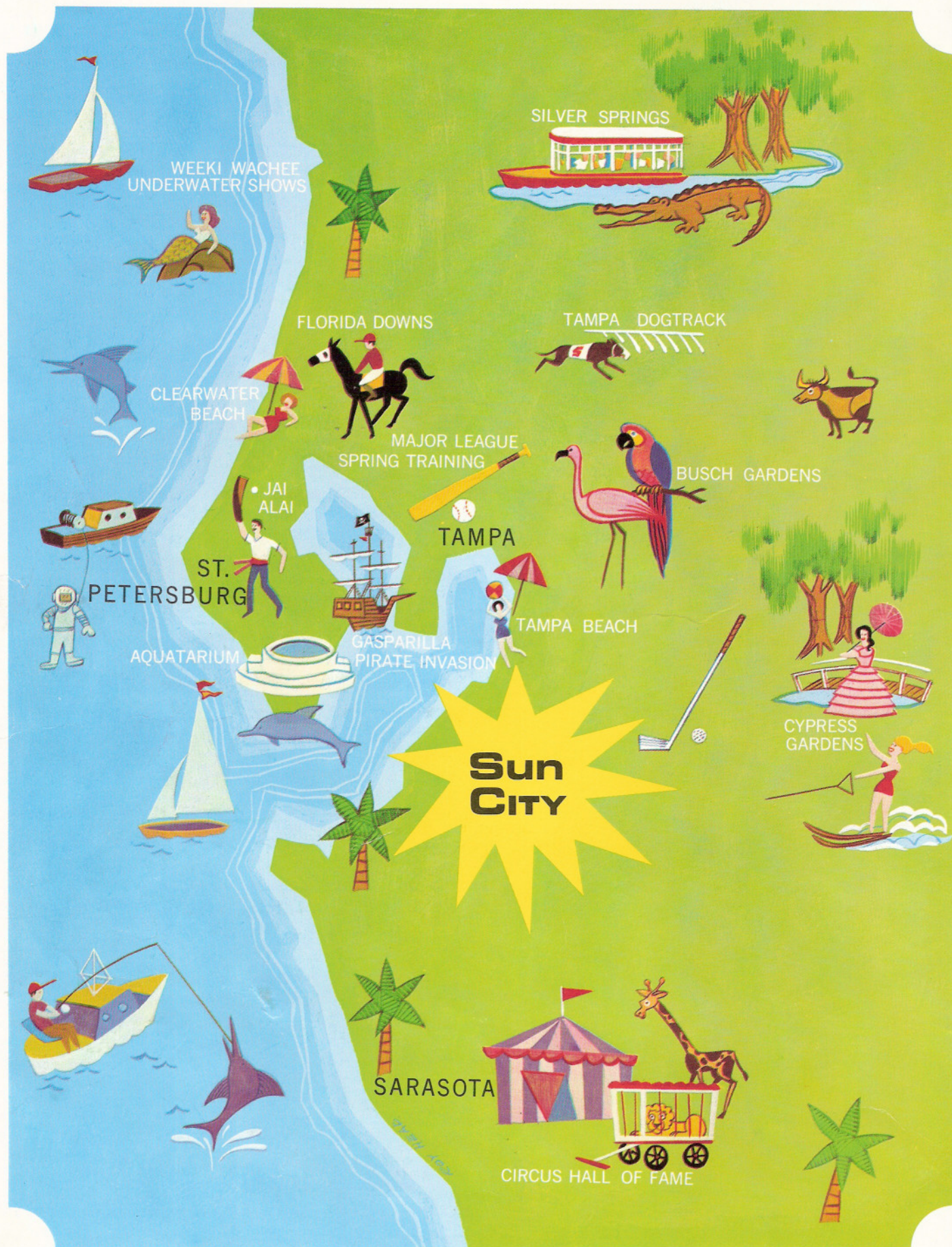
Del Webb's Sun City lies in the heartland of Florida's famous Sun Coast playground.