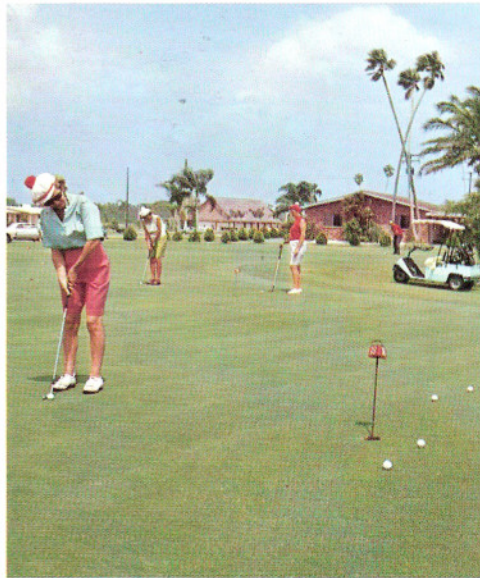
The lush putting greens at the Pro Shop