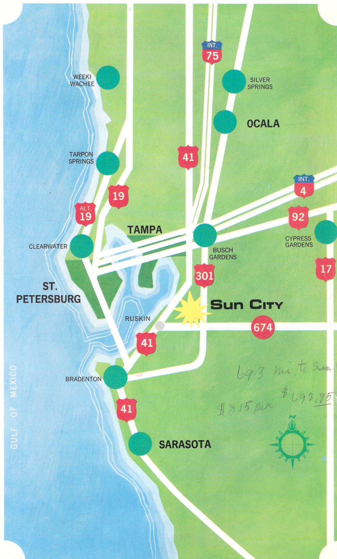
Sun City is easily accessible from all major highways in the Tampa area.

Sun City, in addition to being Florida's finest retirement/resort community, is equidistant to more fun spots than any other fine community in Florida.