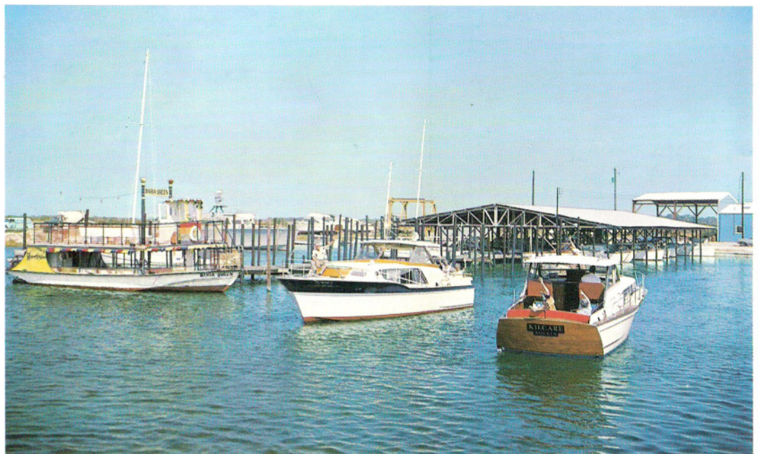
A paradise for fishermen and boat owners — 10 minutes from Sun City