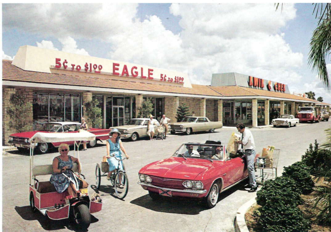
Sun City's own shopping center containing 14 stores and services