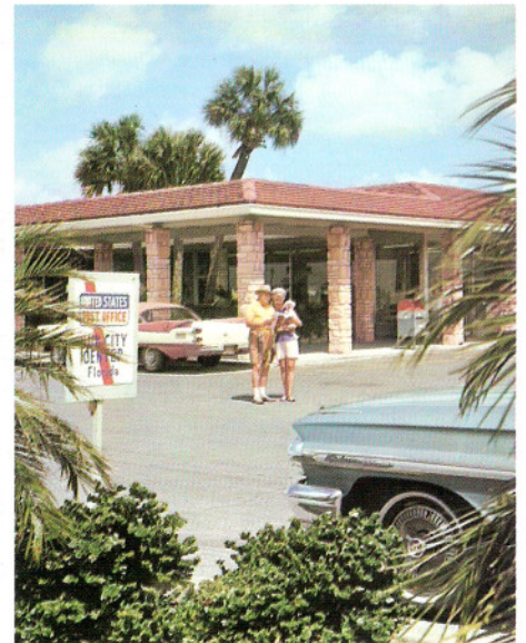
Sun City's own United States Post Office