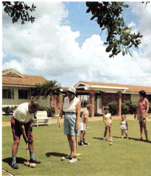
Those golden moments, visits from grandchildren