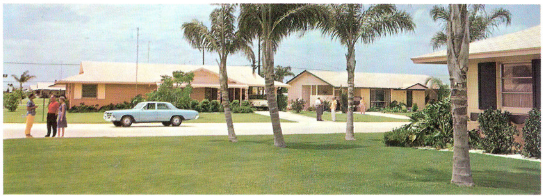
Any street in Sun City is a beautiful street!