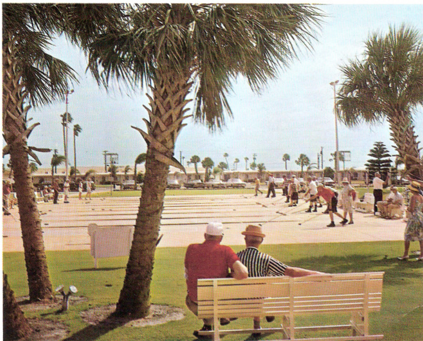
Shuffleboard — a great favorite in Sun City

CIVIC-SOCIAL . . . One of the remarkable things about Sun City is that there are over 40 civic, social and service organizations ranging from international service clubs to the One-Eyed Jacks Saturday Night Regulars. In the traditional American spirit, they are organized by and operated for the participants. It is all entirely voluntary. In any case, you may do what you wish, when you wish and with whom you wish in Sun City.