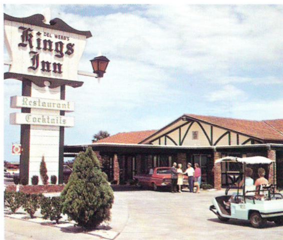
Fine food, drink and lodging in the gracious Kings Inn