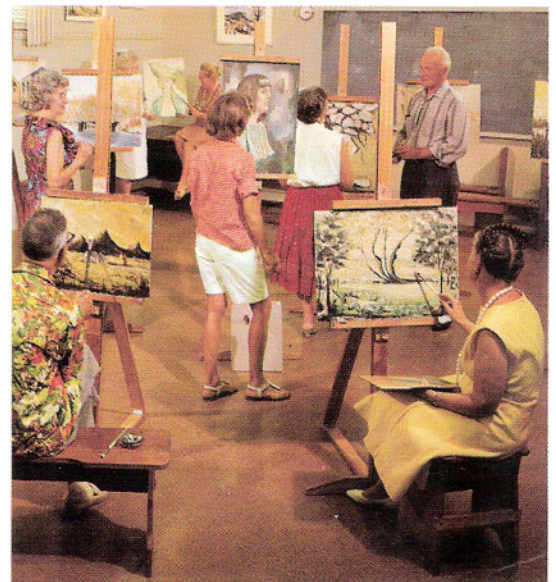
Beginner? Veteran? All are welcome!