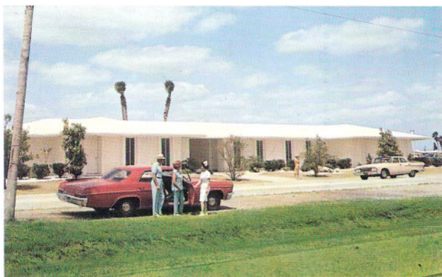
Sun City Medical Center – full medical facilities at hand