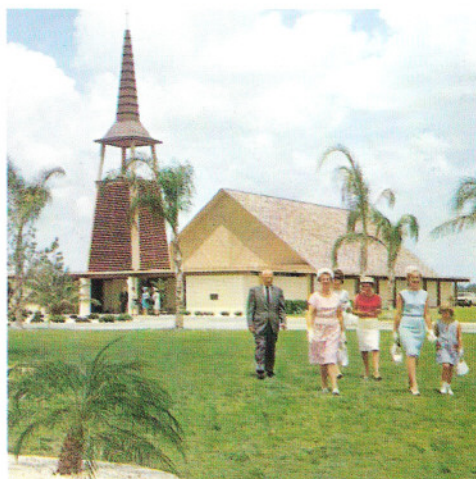
Sunday morning in Sun City