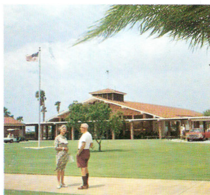
Town Hall, heart of civic and social activities