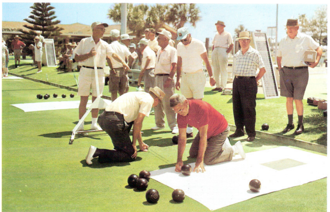
Hot competition! Lawn bowling on the lush greensward