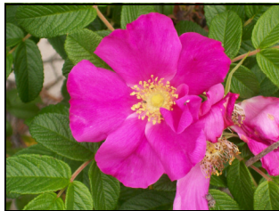
Rose rugosa blossoms