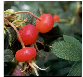
Rose rugosa rosehips