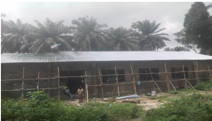
Life of Light Evangelical Church, Pujehun

Church Roofs: Most of the over £3400 raised from the 10K Run has already been sent to EFSL to fund the building of roofs for five churches – in Pujehun, Moriba Town, Rokupr, Sulima, and Masongbo. These were urgent requests, and it is good to have had the extra resources to respond quickly. As you can see, the churches at Pujehun and Moriba Town are well on the way to completion.