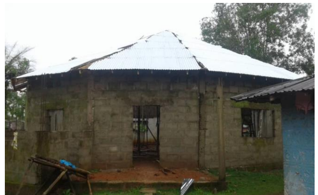
Philomath Community Church, Moriba Town