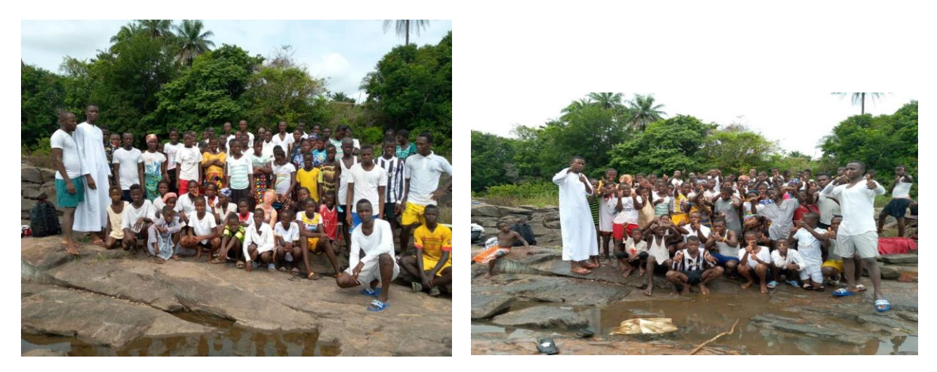
"Our programme of teaching and discussion has also resulted in the planting of three churches in Muslim-dominated villages.

"Recently, our staff were blessed to join with EFSL for a mass baptism for listeners who have called in to make the decision to follow Jesus Christ as their personal Saviour.