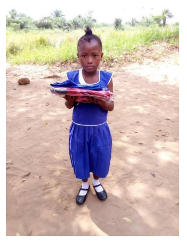
Orphan Children in Bonthe District