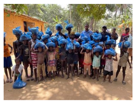
Orphan children in Port Loko District