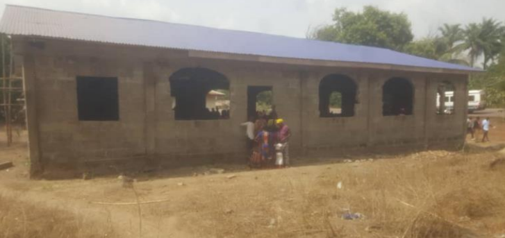
Almost completed work on Cross Purpose Church, Koindu, and Manyeh Community Church