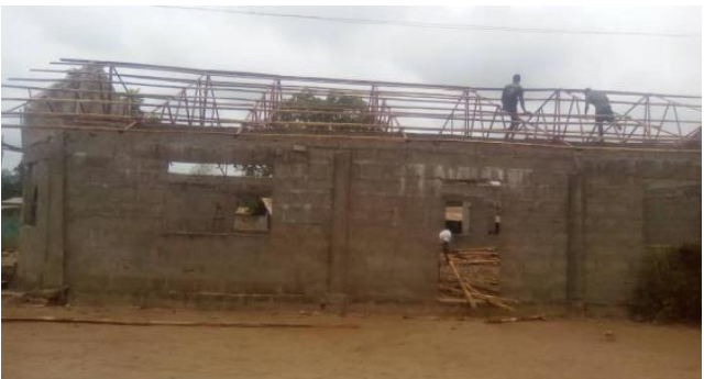
Ongoing roofing work on the Baptist Church at Tintafor, Lungi