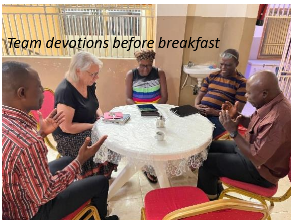
Team devotions before breakfast

Kono There were 99 delegates at Kono, mostly young couples. The couples enjoyed interacting with each other and praying together.