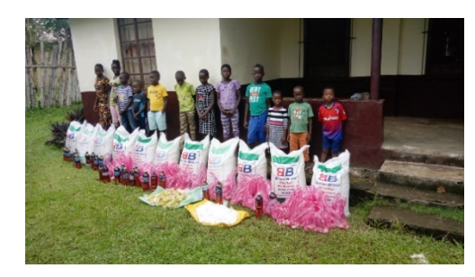
Ebola orphans supplied with Food at the EFSL Office in Mattru Jong

Ebola orphans supplied with food in Semabu Village and school materials in Mowagor village