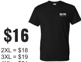
Item # 1

Return Order Form & Payment to a Women's Committee Member