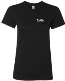
Item # 4

9.5 ounce, 80/20, Made in USA S, M, L, XL, 2XL, 3XL, 4XL