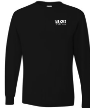
Item # 2

100% Cotton, Made in USA S, M, L, XL, 2XL, 3XL, 4XL