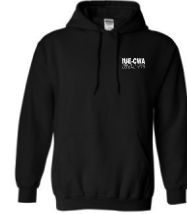
Item # 3

100% Cotton, Made in USA S, M, L, XL, 2XL, 3XL, 4XL