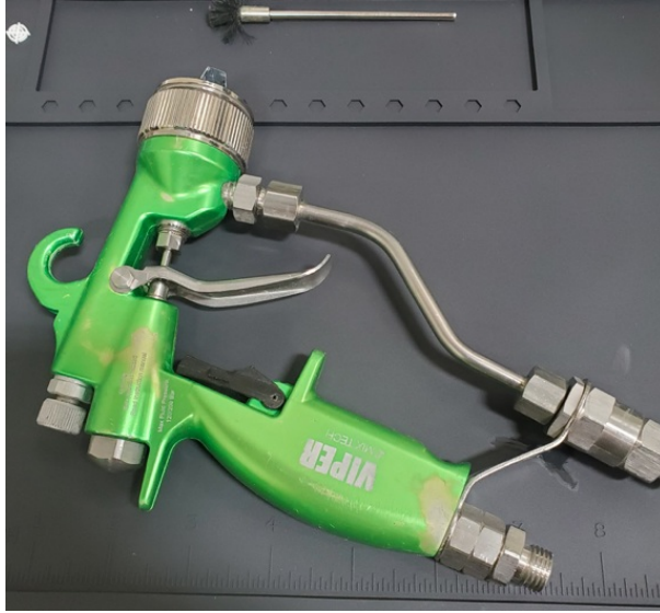
VIPER® spray gun cleaned with Simple Green