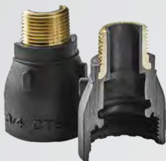
Cross section of the Male Iron Pipe (MIP) Connection

All threaded connections are a hybrid design and incorporate a no lead brass sleeve into the mold for a watertight, easy connection.