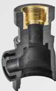
Cross section of the Female Iron Pipe (FIP) Connection