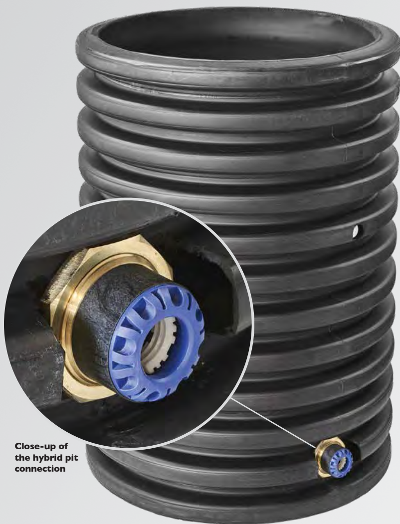
Close-up of the hybrid pit connection

The Meter Pit has been designed as a cost-effective alternative to brass ones. It is lightweight and incorporates the Megatite connection on all joints for easy replacement or change out of parts.