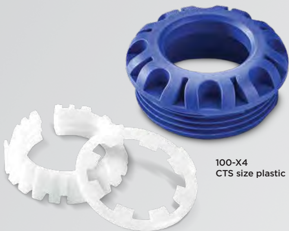
100-X4 CTS size plastic