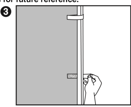
STEP 3: Attach the side locking strips around the frame leg. Repeat for remaining leg.

Press top locking strips together firmly.