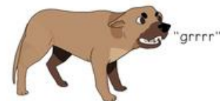
Fearful: Ready To Fight