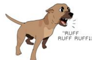
Angry: Ready To Fight