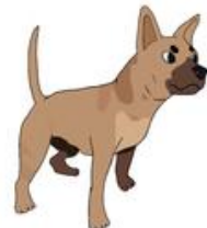
Wary / Unsure Suspicious