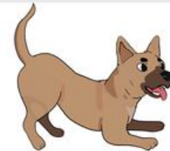
Ready To Play