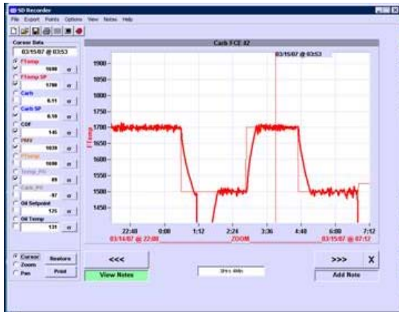
Control with a cracked radiant tube

The oxygen probe will also react with the by-products of combustion if the furnace is gas fired and has a cracked radiant tube. The oxygen will dilute the atmosphere in the heat chamber when the furnace goes to high fire. As a result, the carbon controller will compensate by calling for more enriching gas to increase the carbon potential. This can often be identified on a chart or digital recorder with a saw tooth look to the carbon trend. Setting the control to low fire will eliminate the saw tooth effect and prove the leaky tube as the issue. The next step is to determine which tube is the problem.