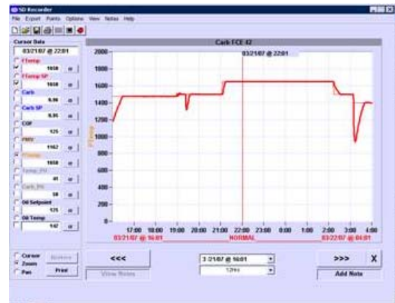
Control without a cracked radiant tube