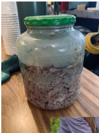
C'ETSIGHAAN' FERMENTED MOOSE BRAIN