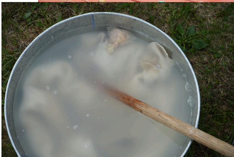
C'ETSIGHAAN' TU' FERMENTED MOOSE BRAIN WATER