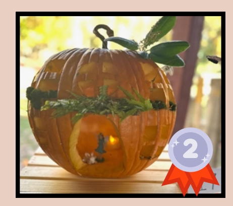
The Geronimo Family